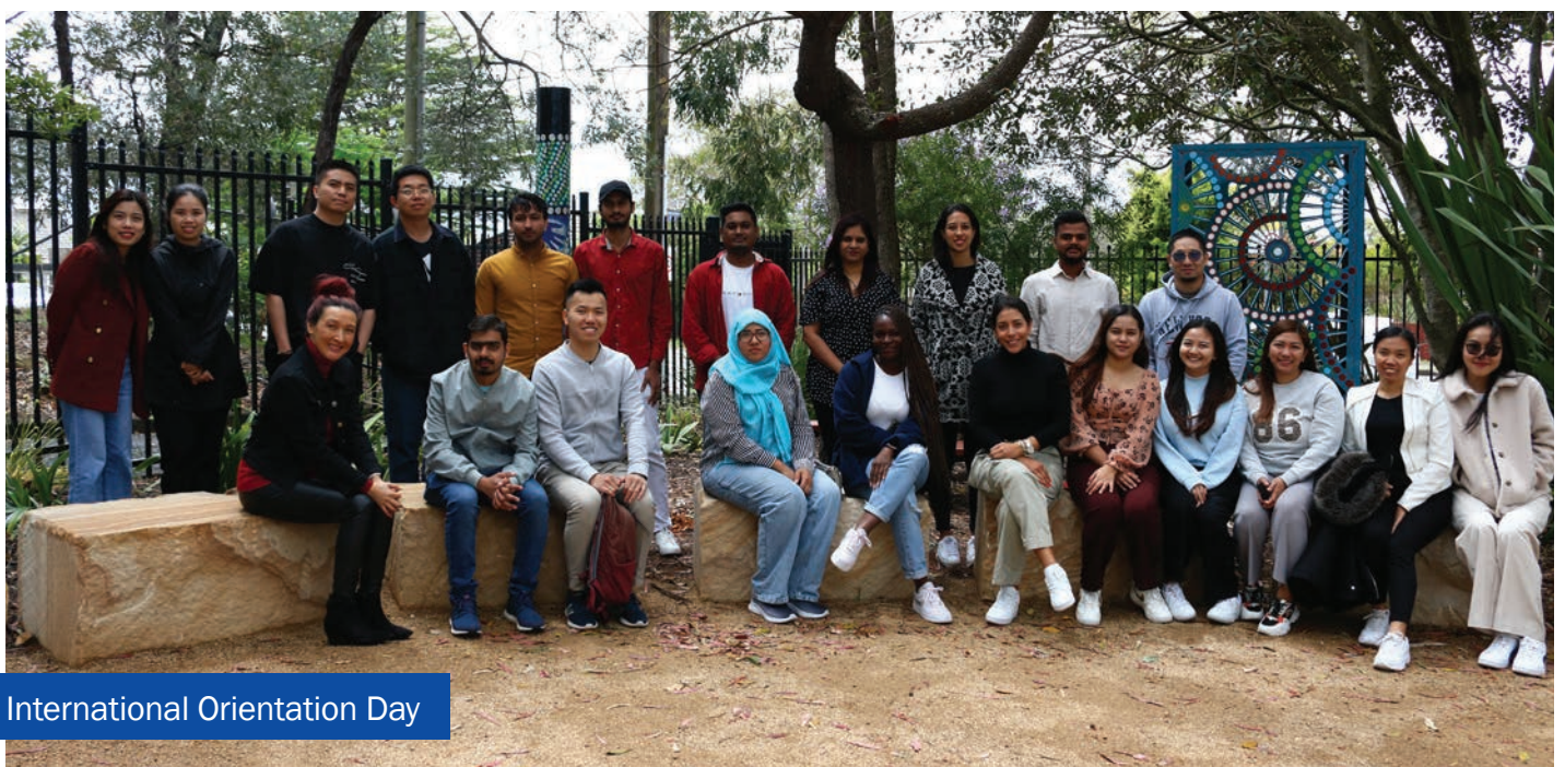
International Orientation Day

Stay connected, look out for your friends, and always trust your instincts. With the right information and support, your time in Australia will be both safe and memorable.