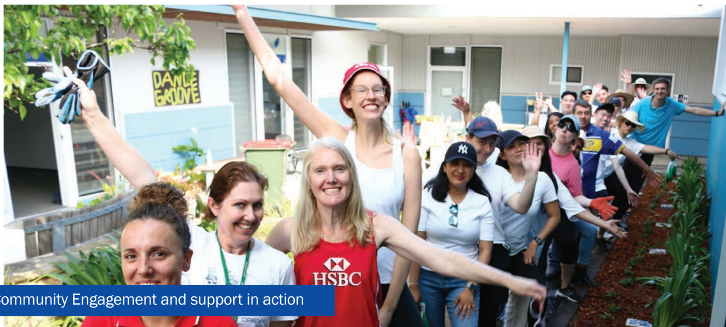
Community Engagement and support in action