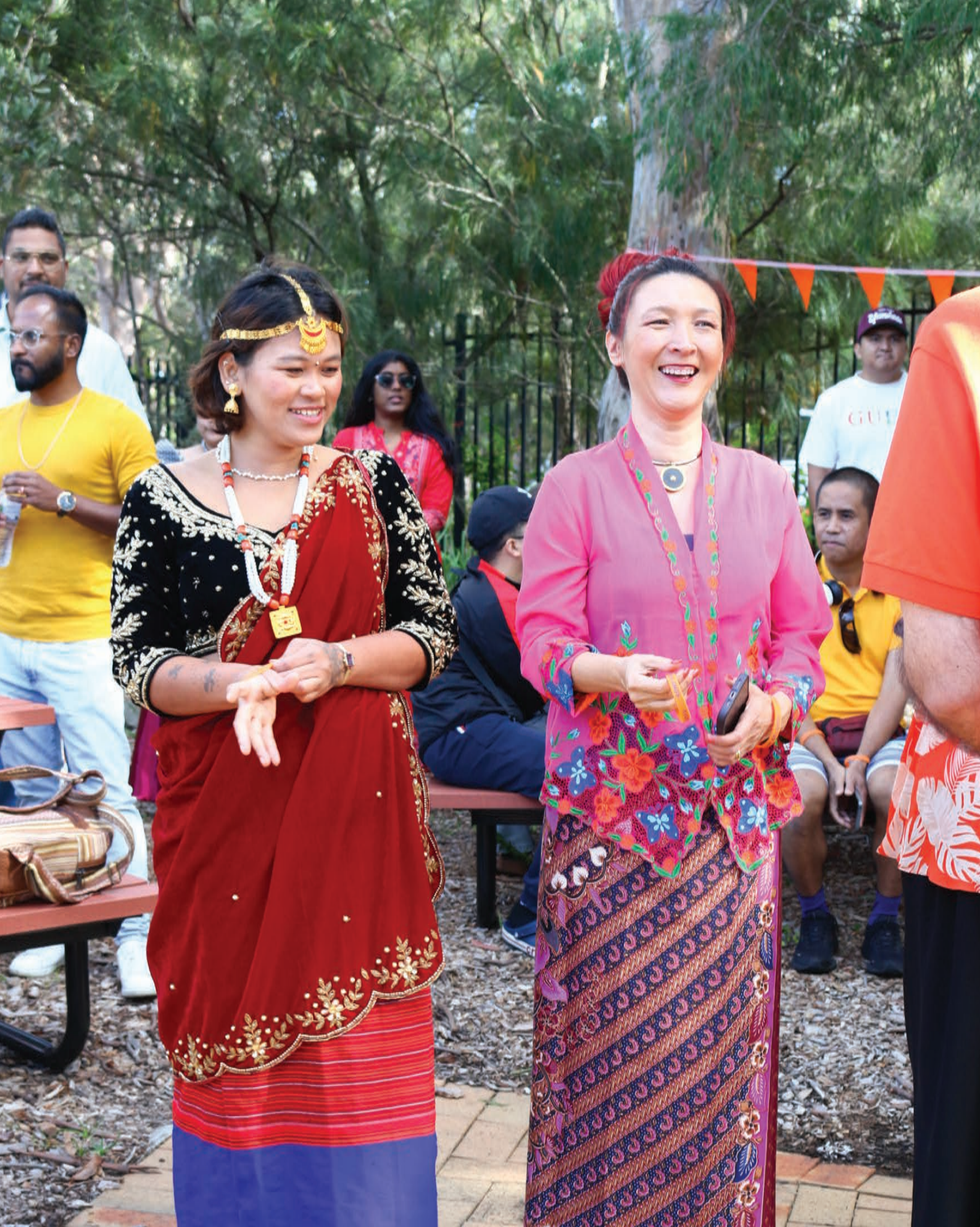
Harmony Day - Everyone Belongs