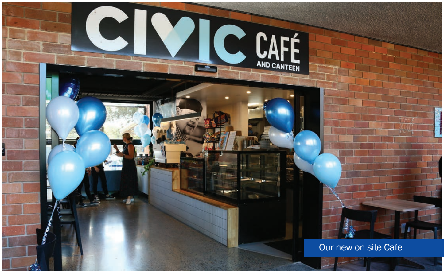
Our new on-site Cafe

In other instances, information collected during your enrolment can be disclosed without your consent where authorised or required by law - this may include the circumstance of any suspected breach by the student of a student visa condition.