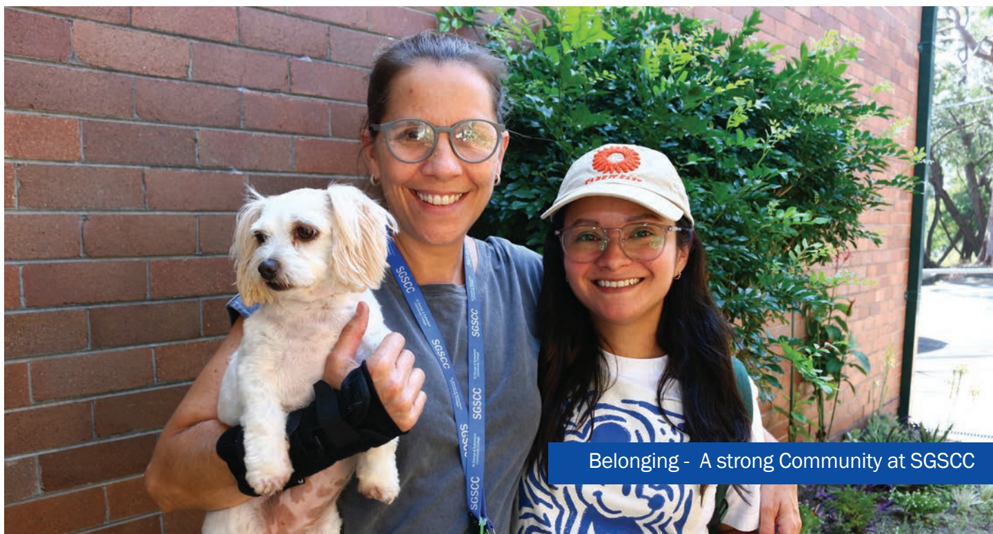
Belonging - A strong Community at SGSCC