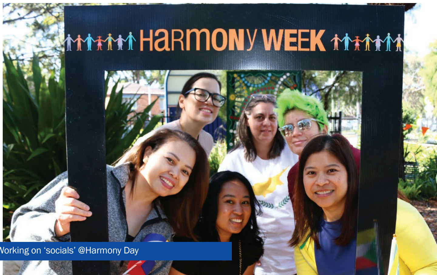
Working on 'socials' @Harmony Day