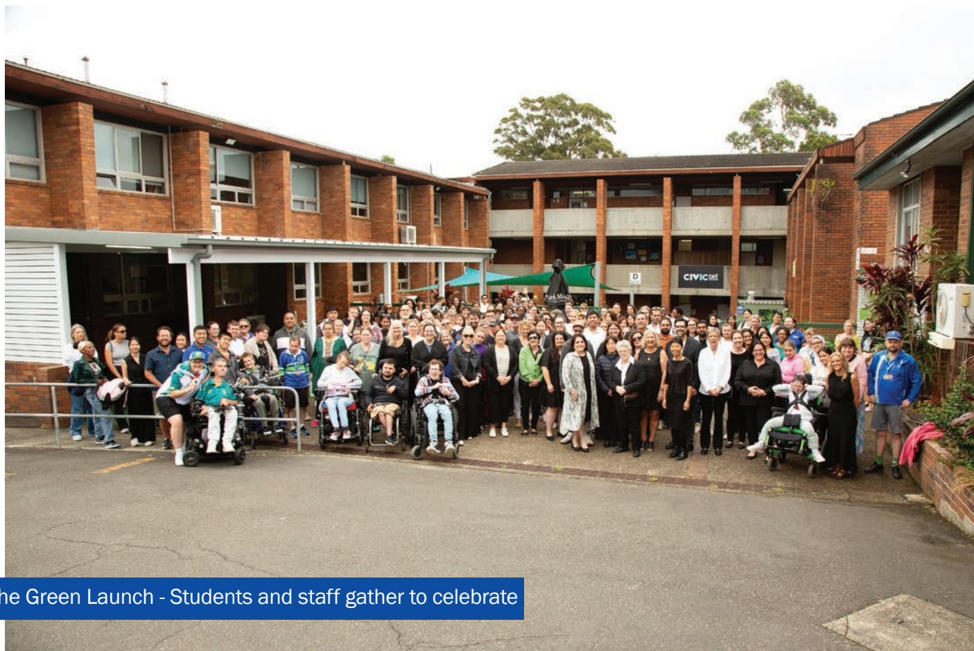
The Green Launch - Students and staff gather to celebrate

All international students are required to pay for OSHC for the duration of their student visa. Visa-length OSHC ensures you will not have to pay any premium increases for the length of your course, subject to goods and services tax (GST). You will be entitled to a refund of any outstanding balance if you leave Australia before you intended, provided there is at least one month remaining before your health cover expires. You should pay the premiums for OSHC when you accept your offer.