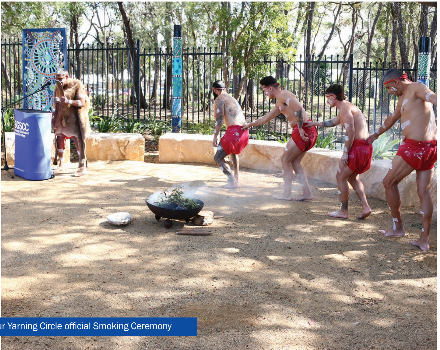
Our Yarning Circle official Smoking Ceremony