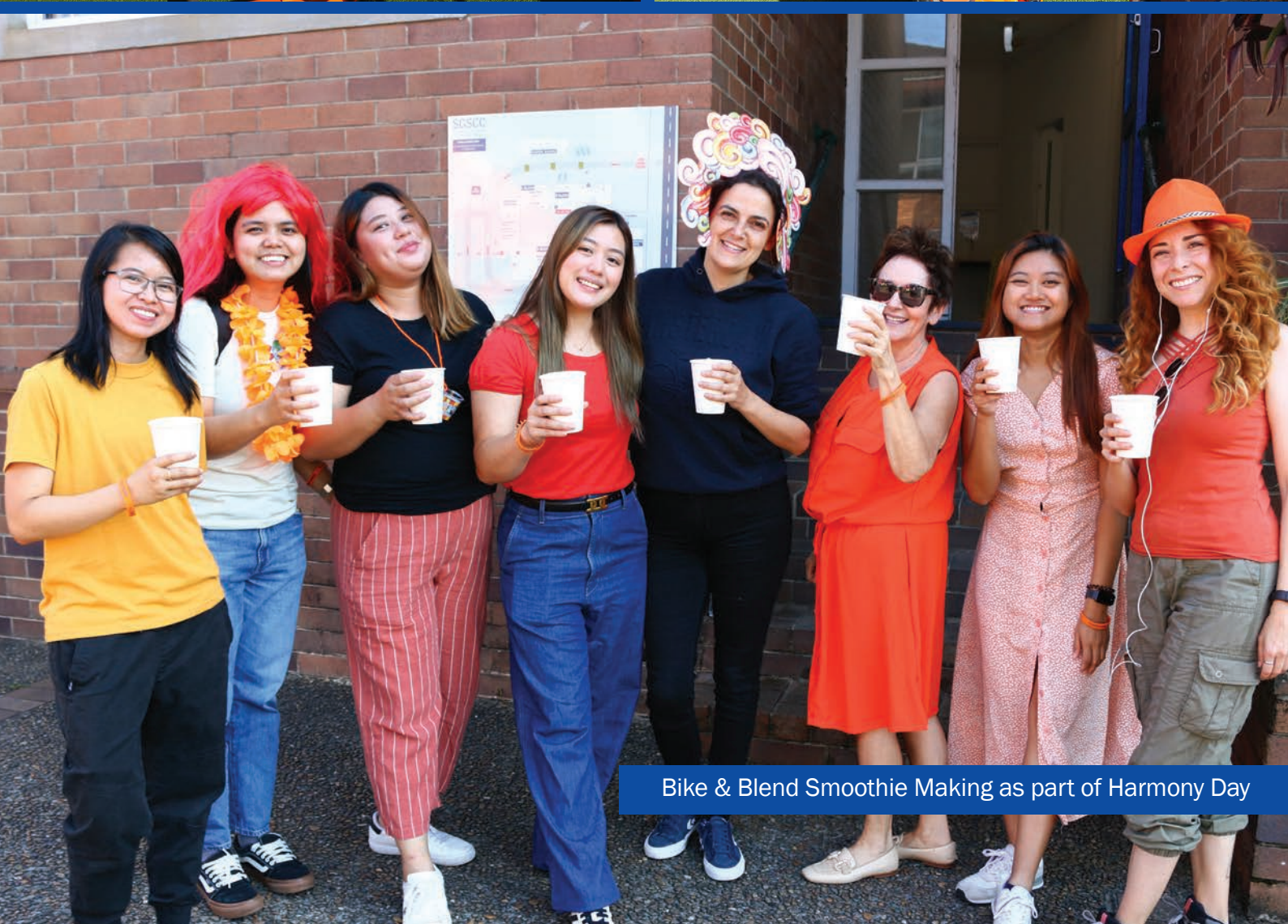
Bike & Blend Smoothie Making as part of Harmony Day