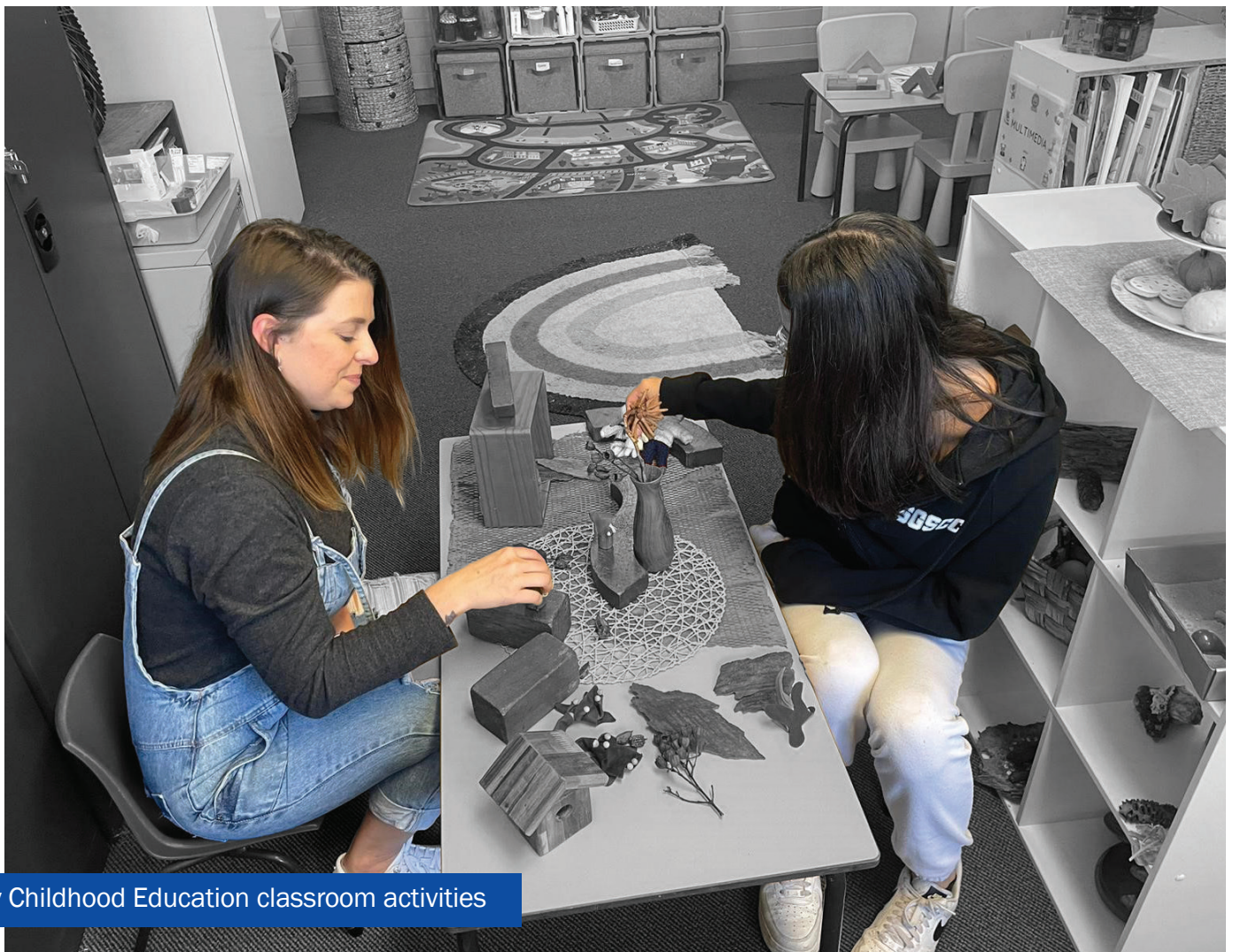
Early Childhood Education classroom activities

Visit: www.immi.homeaffairs.gov.au/help-support/meeting-our-requirements/health to learn more.