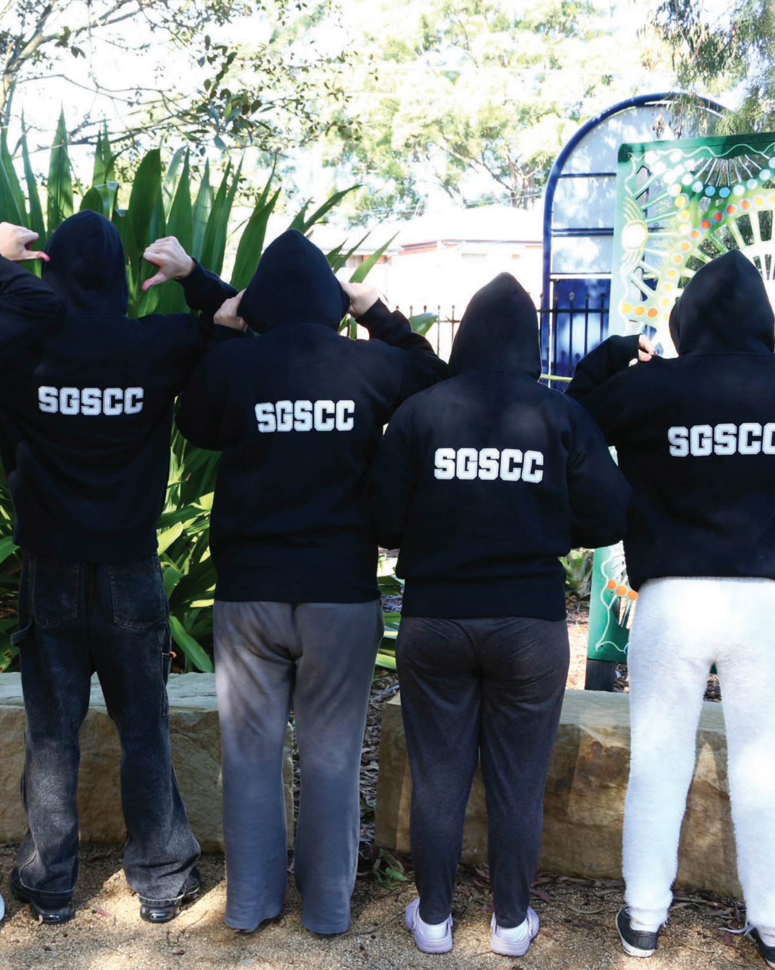
SGSCC Merchandise on full display