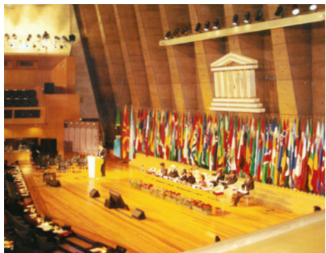
Opening UNESCO Conference - Paris 2007