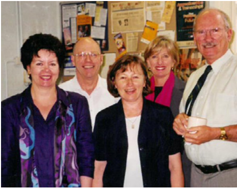
Catching up with fellow Community College Colleagues