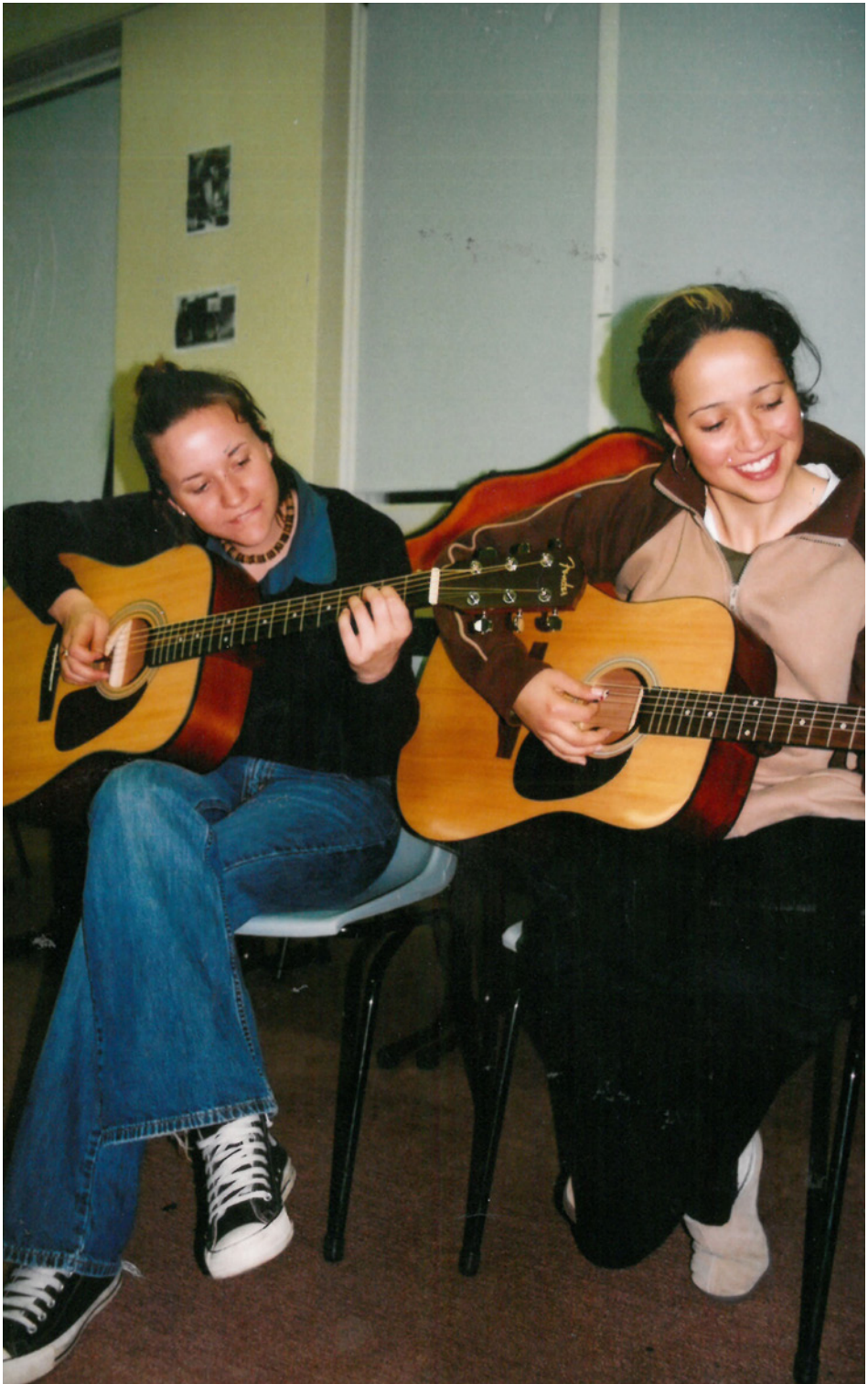
Students getting to grips with basic chords