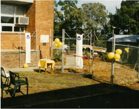
Community Garden Launch