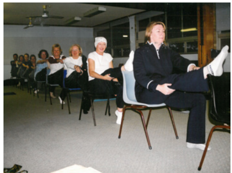
Seated Yoga... so synchronised