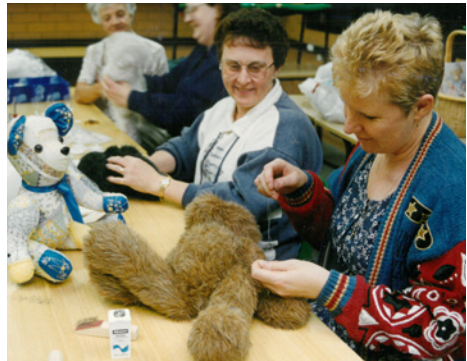
Teddy Bear Making Class... so cute