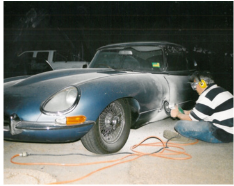
Motor Vehicle Restoration