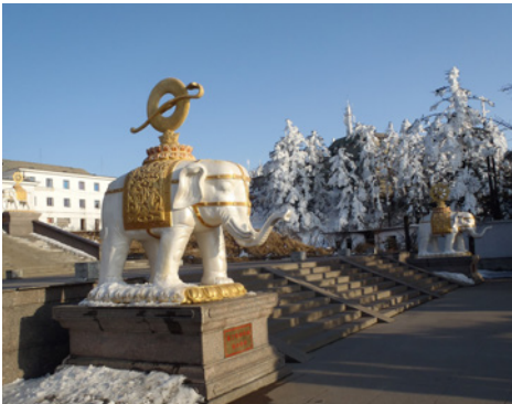
Mt Emei, Chengdu