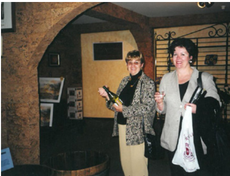
Community College Principals having fun