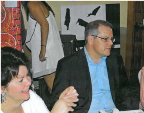
With our PM - Artitude Launch