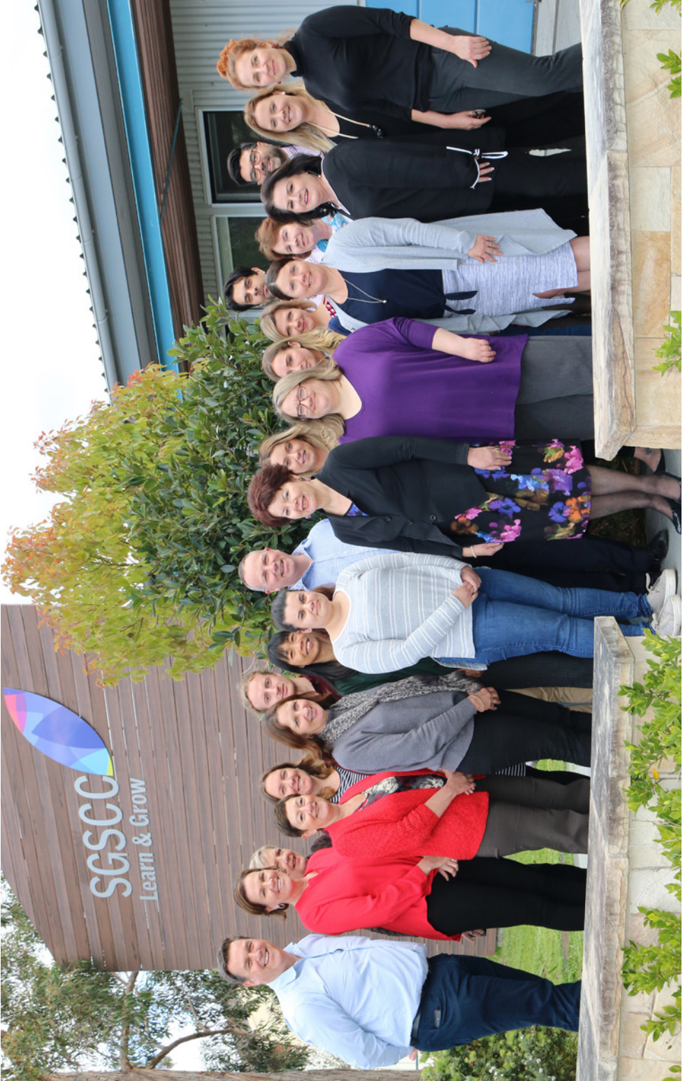
The SGSCC Team - 2018