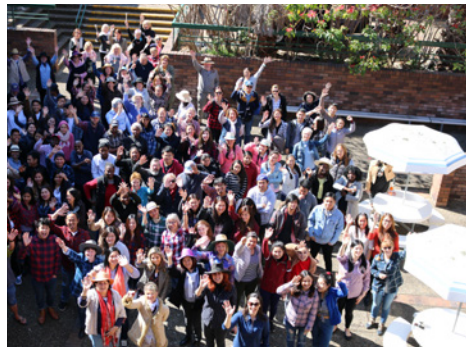
"Fiver for a Farmer" Fundraising at SGSCC