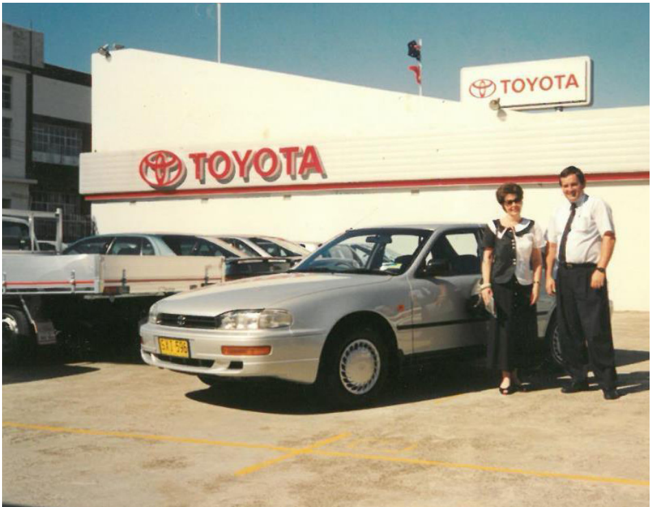
One of the early College Cars. We worked hard for this!