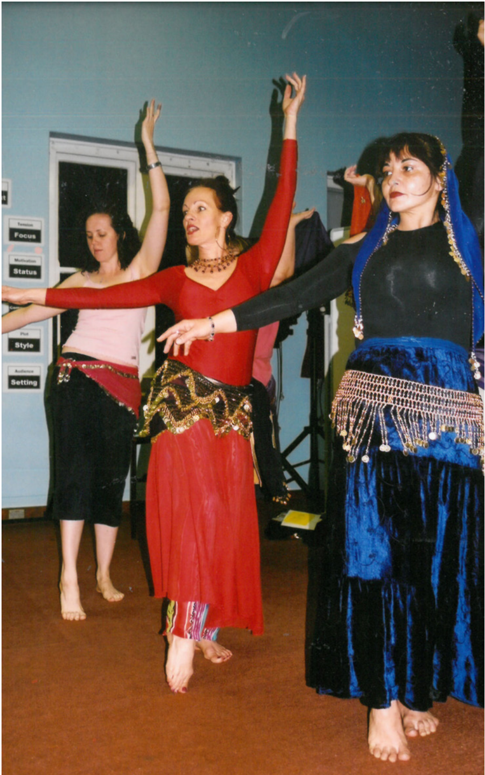
Arabic Dance Classes