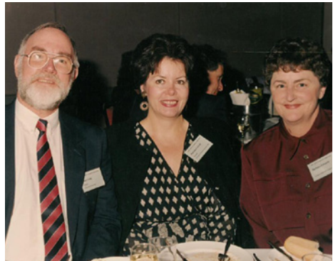
Ongoing Professional Development