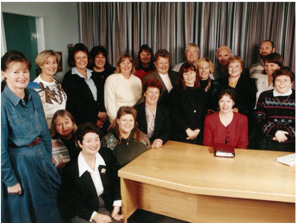
Jannali Staff - 1997