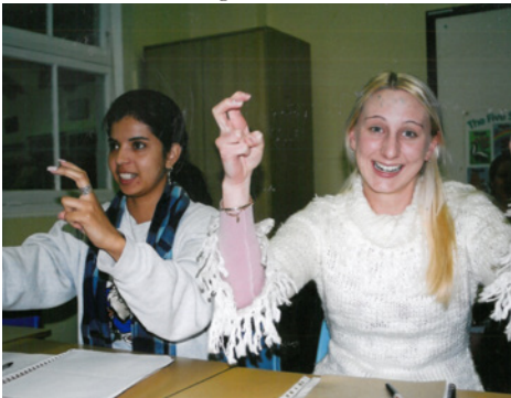
Sign Language Students communicating