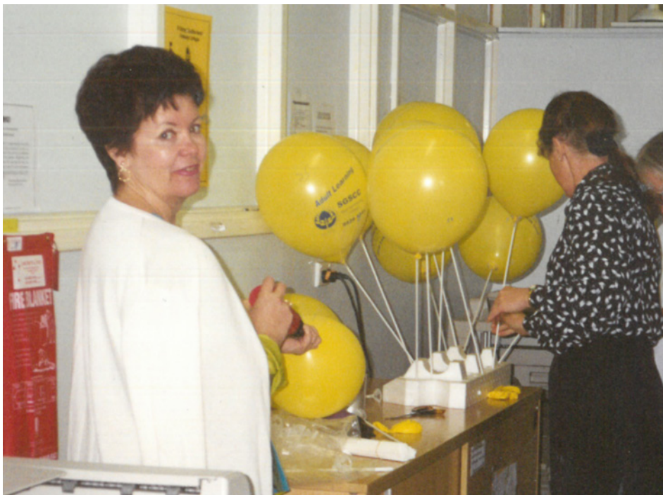
Adult Learners Week Celebrations - All hands on deck