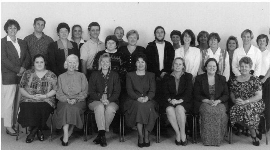
LEAP, Disability and infrastructure staff, Jannali - 1994