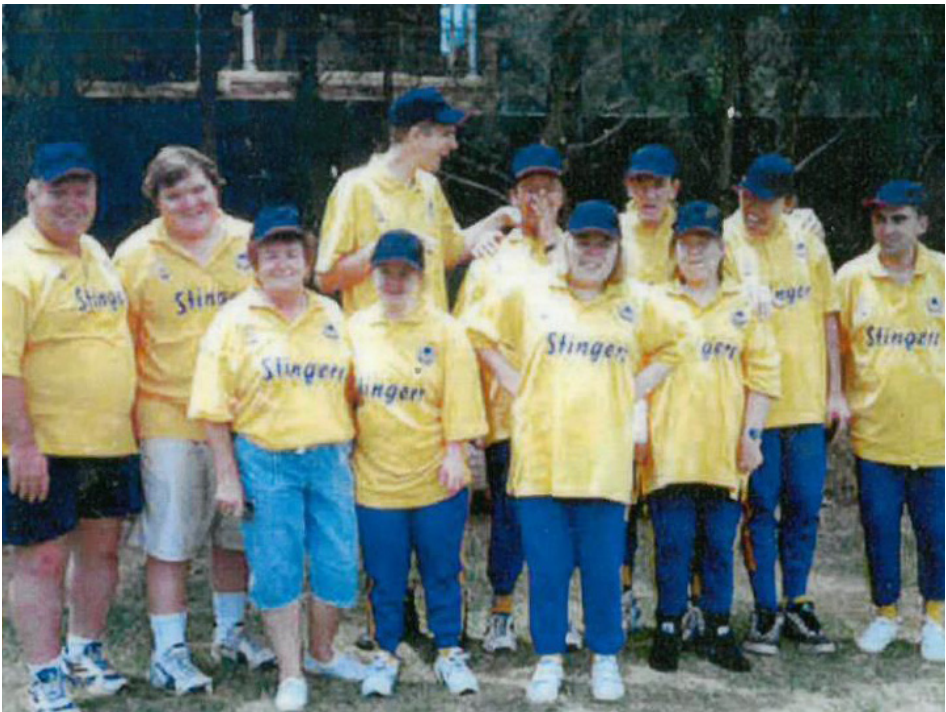
Tee Ball Team - SGSCC disAbility