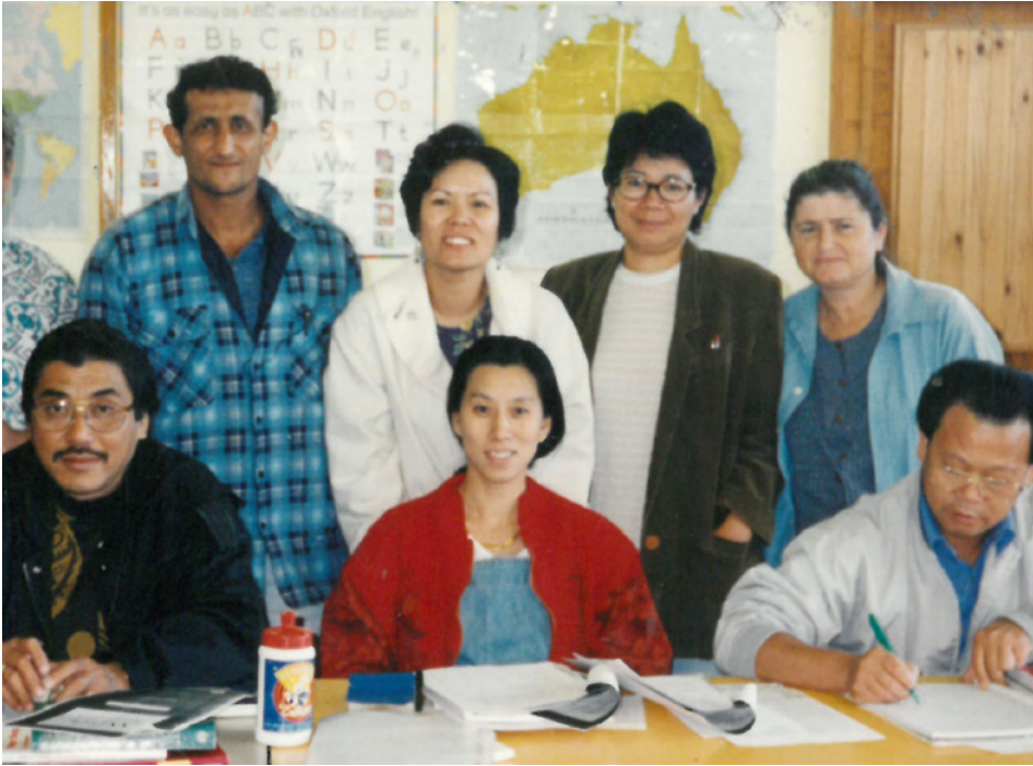
AMEP Students Hurstville late 1990's