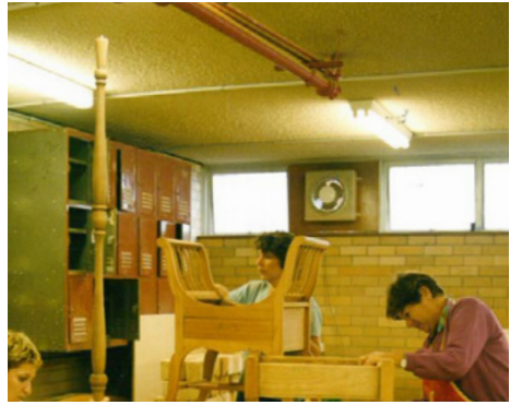
Furniture Restoration Class