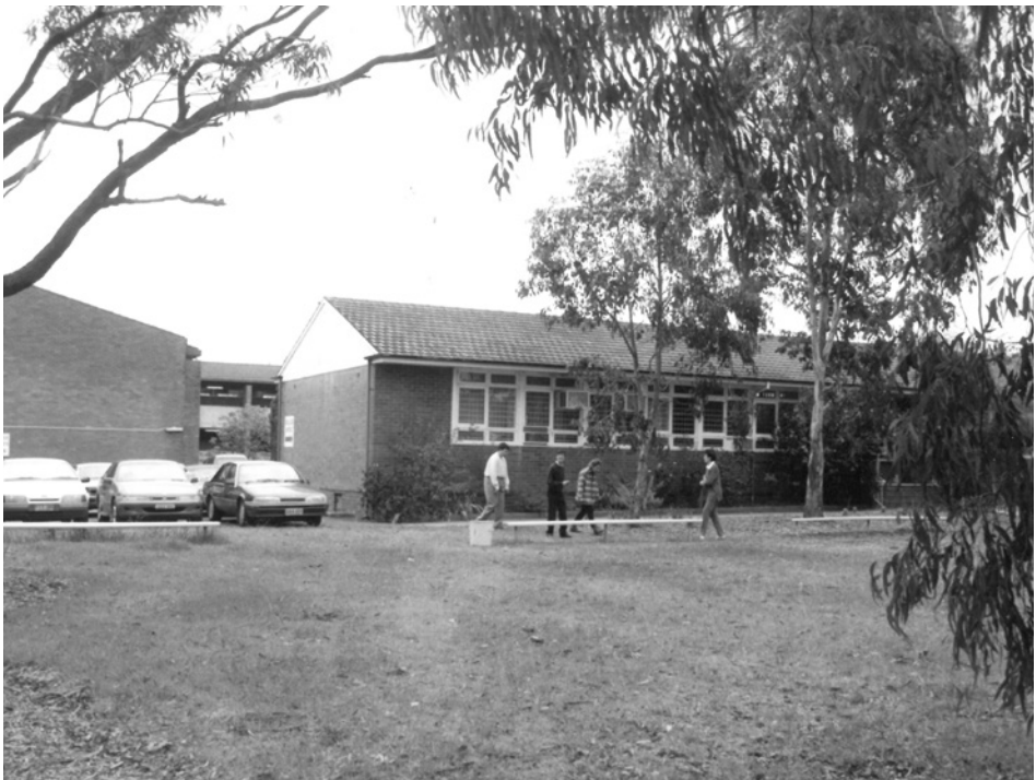
Greenspace before the Bransgrove Building was constructed