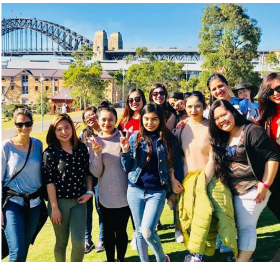
Overseas Student Excursion to the City

We have also offered, over the years, bi-lingual courses for tourist guides, non-accredited short Study Tours, combining short, focussed English courses in the morning followed by tours around the great sites of Sydney for groups of children or groups of adults, so far mostly from China and Russia. Over the years more than 1500 people have attended these courses. As mentioned previously, we have hosted formal visits from teachers and academics, bureaucrats and VIP'S from several countries in Asia and from Africa, including the Kenyan Educational Attache.