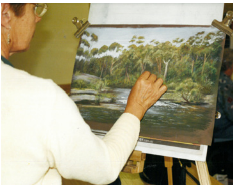
Student drawing a local landmark