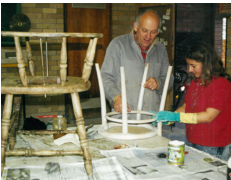
Trash to Treasure - Furniture restoration students priming a chair