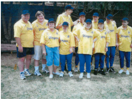
The Stingers - SGSCC disAbility Baseball Team