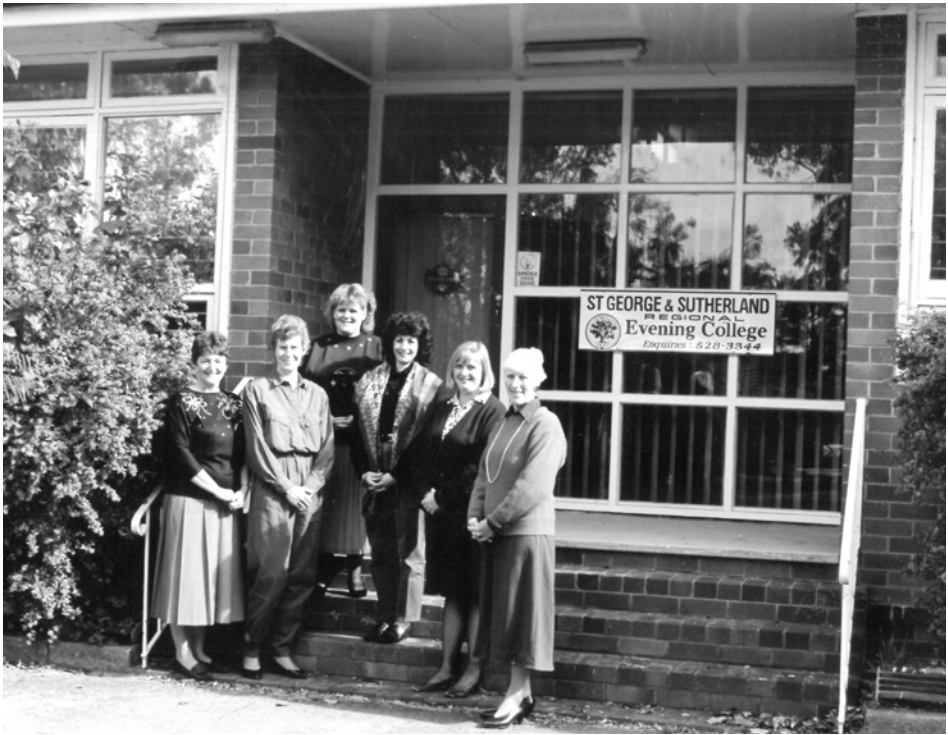
Front of house staff at Reception Entrance of Jannali Centre, Early 1990's. A home at last