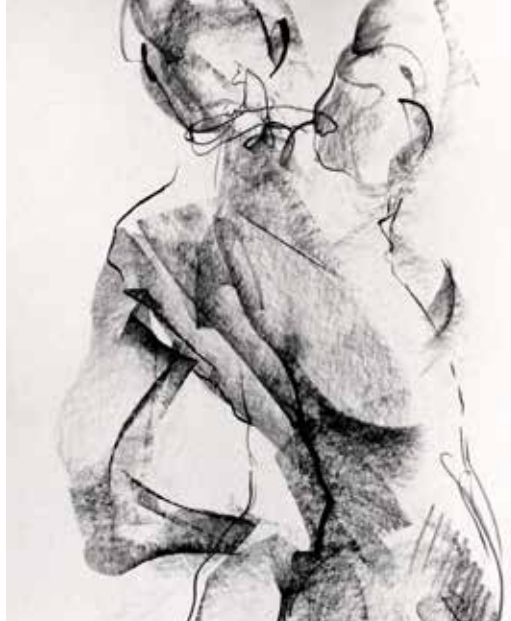
Michael Herron Figure Drawing (detail)