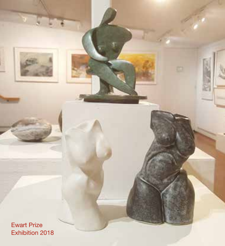
Ewart Prize Exhibition 2018