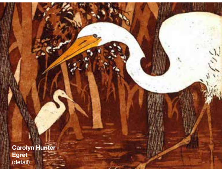
Carolyn Hunter - Egret (detail)

This 5hr course welcomes both beginners and advanced participants to explore many aspects of Relief printing using wood, lino, plaster and other surfaces for printing. Both European and oriental methods will be explored with students working independently. Printing will be done both by hand and using studio presses. A variety of papers will be tested and prints may be adapted to book art. Cost includes $45 of basic materials. Please contact the tutor with any queries.