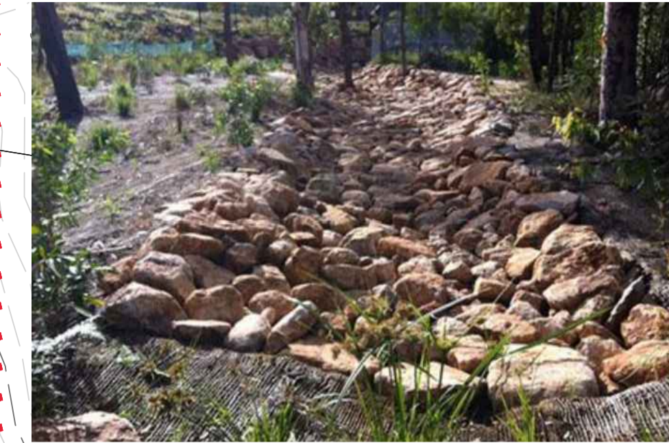
Example of swale for stormwater purposes. Grass and rock swale only to allow for passage of fauna.

Stormwater infrastructure (swale) to be wholly located in existing cleared area. No clearing of non-juvenile koala habitat trees is to be undertaken to facilitate construction of swale, and the area immediately surrounding to be stabilised and revegetated in accordance with rehabilitation plan.