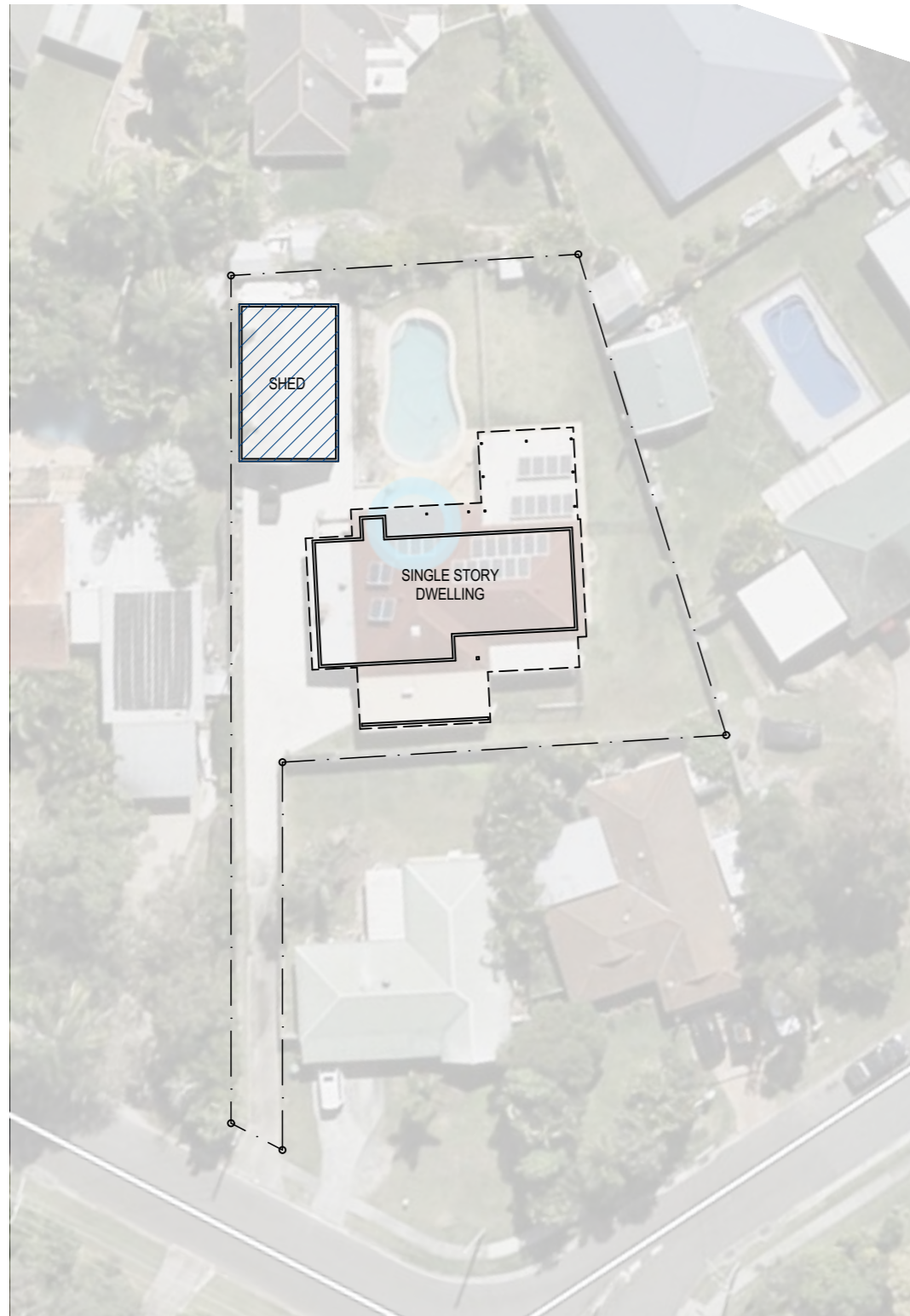
○ SITE PLAN 1:500