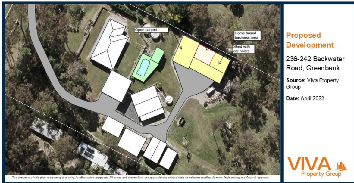
FIGURE 4 PROPOSED DEVELOPMENT

The proposed development is depicted in Figure 4 below.