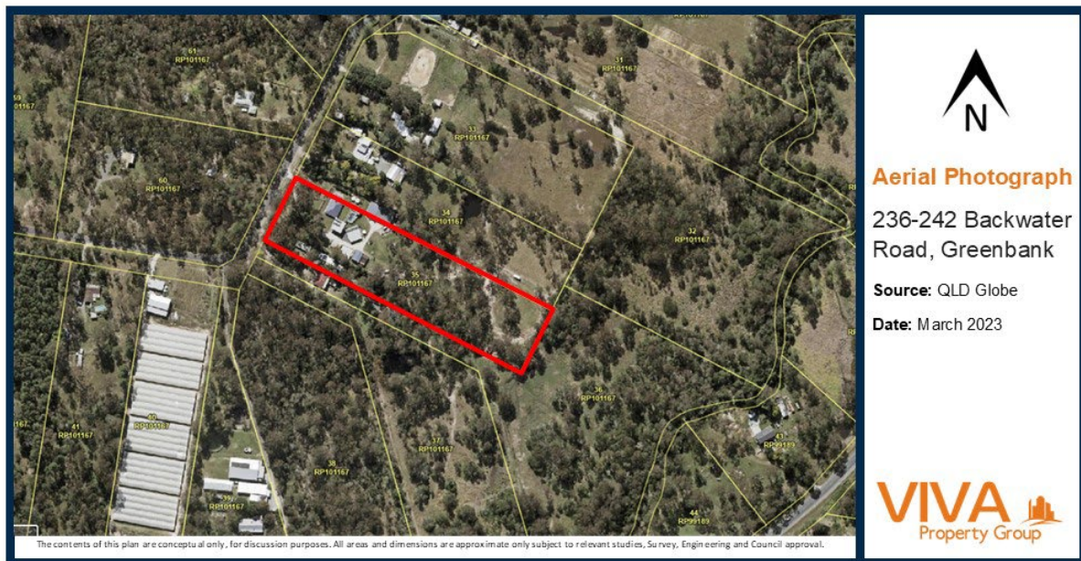
FIGURE 3 AERIAL PHOTOGRAPH