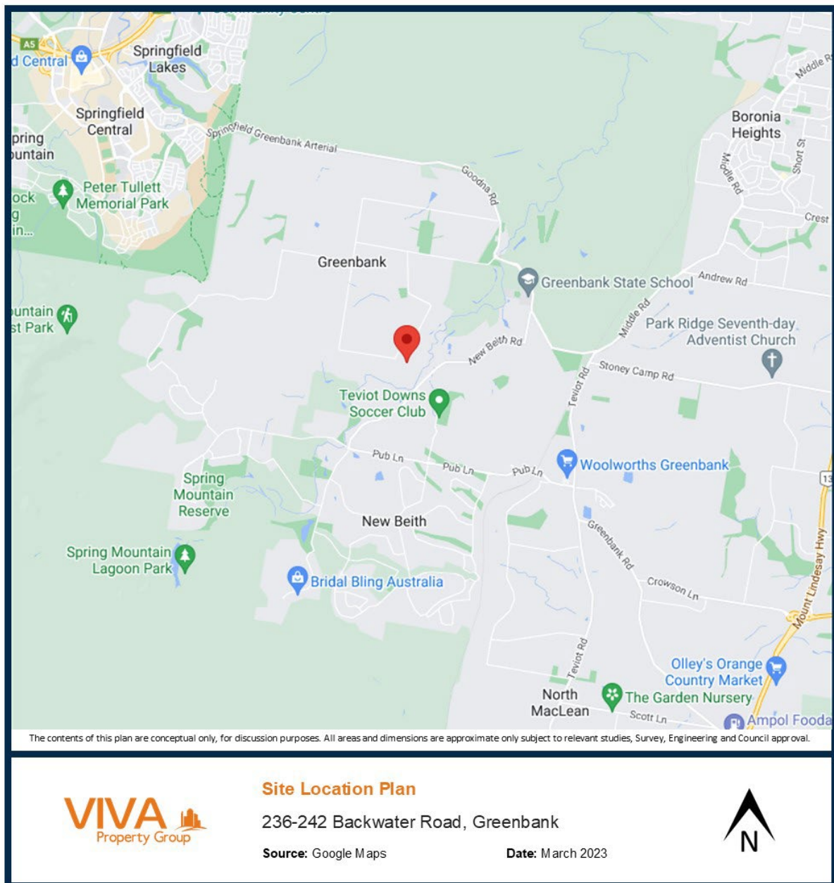
FIGURE 1 SITE LOCATION PLAN

Figure 1 below provides an overview of the location of the subject site.