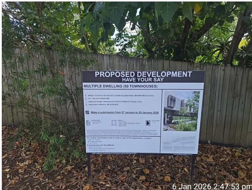
Sign placed along frontage 2