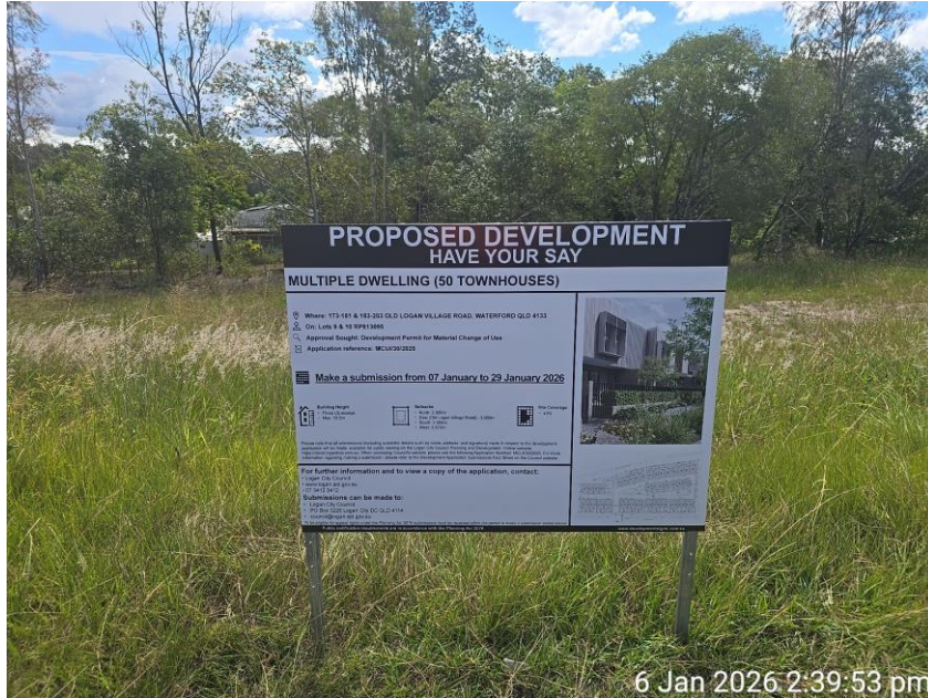
Sign placed along frontage 1