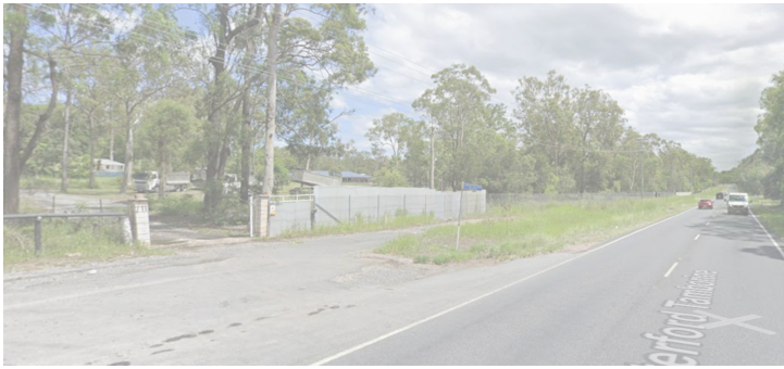
PERSPECTIVE - NORTHBOUND