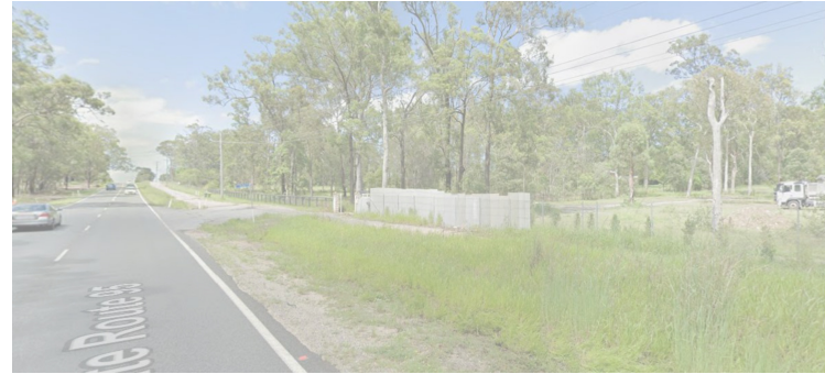
PERSPECTIVE - SOUTHBOUND