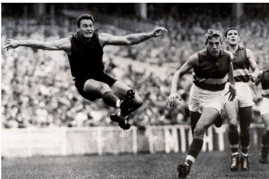
MELBOURNE, AUSTRALIA - 1964: Ron Barassi of the Melbourne Demons in action during a VFL match held in Melbourne, Australia.

Barassi won six premierships with Melbourne club as a player between 1955 and 1964. He coached Carlton to two more in 1968 and 1970, and North Melbourne to flags in 1975 and 1977. He is surprised by Hawthorn's four premierships in eight years because the competition is larger and more competitive today.