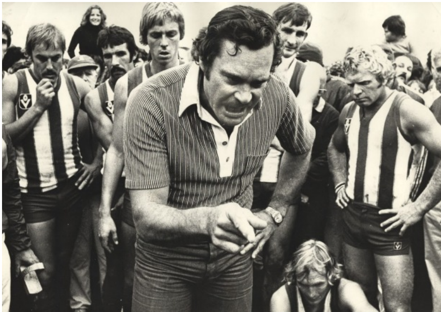
Neg No P 9735. Pub 14-4-1996 Ron Barassi NORTH MELBOURNE COACH giving his team a serve