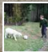
Lucky liked to be with us. Now we were Lucky's flock. I played with him.