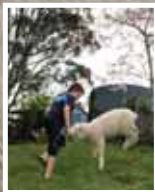
Lucky ran and jumped and skipped in the afternoons.