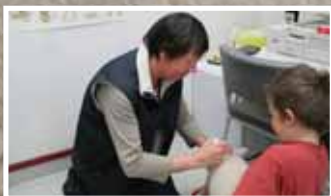
Lucky got medicine from the vet, so he won't get sick.

Have the children predict the text for this page. Praise them for using words that are similar to the author's vocabulary and style.