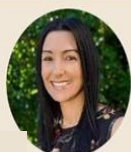
NAC Women's Ministry Director

Connect online each Tuesday via: https://adventistchurch.zoom.us/j/5886527893