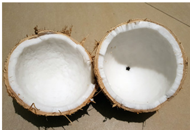
My first cracked coconut

Here are a few lessons from that experience: