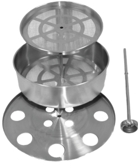
COFFEE MEASUREMENT TABLE

If drip persists, unscrew the tap bonnet, then remove and replace silicone seat cup.