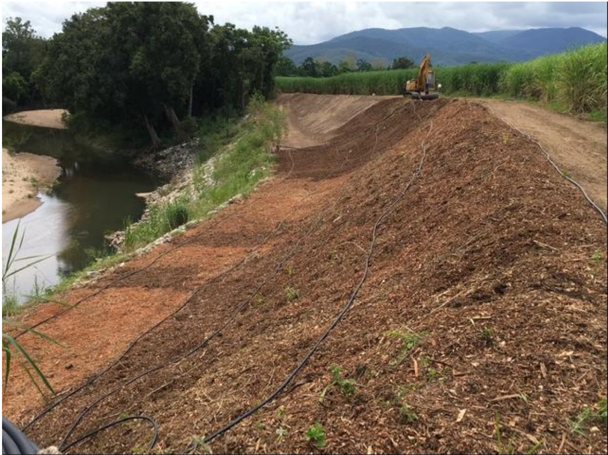
SR-2 - Stone River (Trovato).