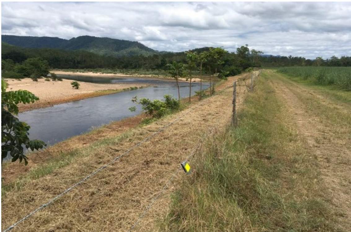
Site slashed and ready for planting. Contractor - Wayne Forden.