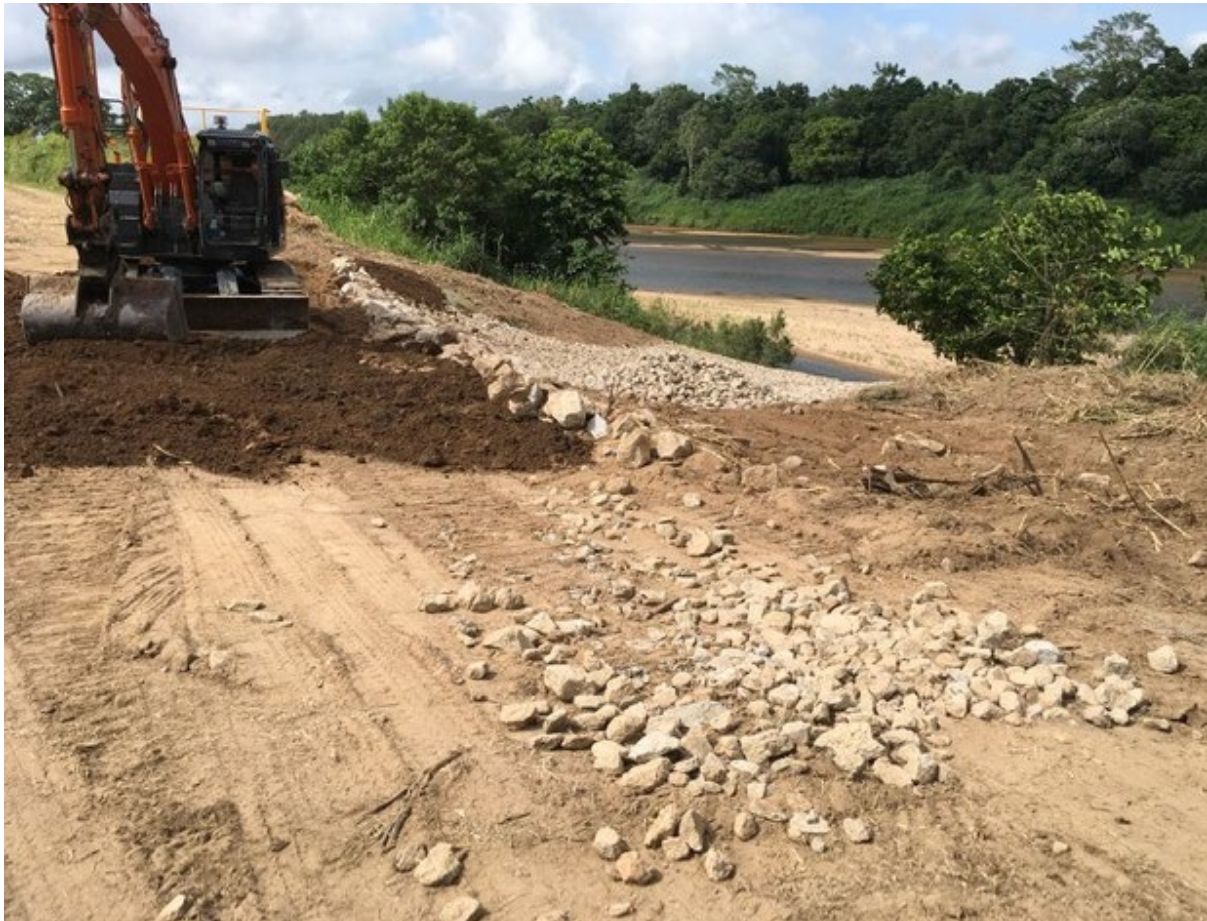
Fill and rock work in place - site being trimmed (25/11/2022).