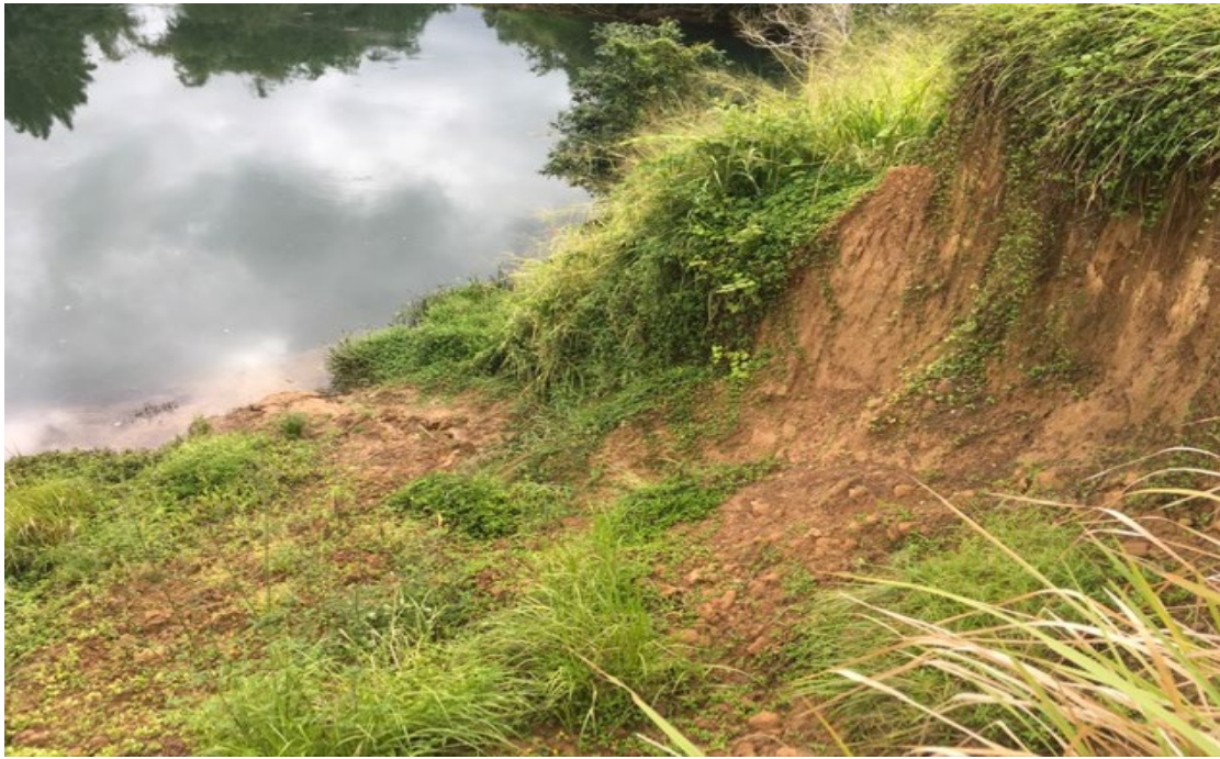
Herbert River. Bank erosion and slumping - a result of the Monsoon Trough rainfall event in 2019.