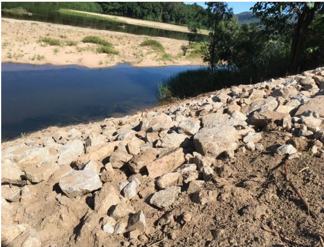
Lower rock protection and seepage layer in place (23/11/2022).