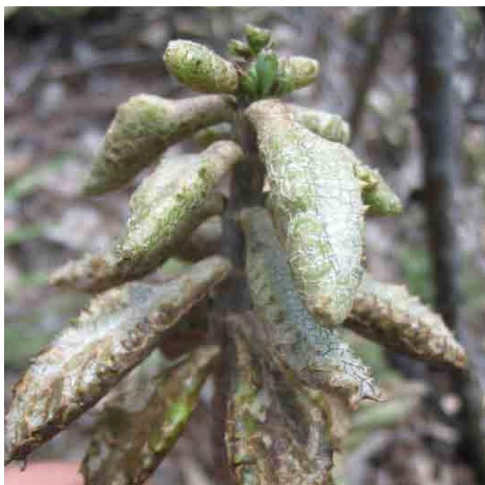
South African citrus thrips damage to mother-of-millions