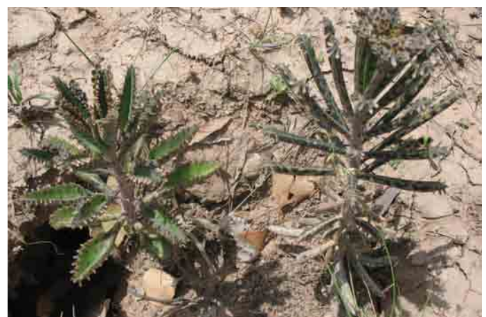
South African citrus thrips adult

The thrips populations vary from year to year, according to mother-of-millions populations and climate. The South African citrus thrips should not be seen as a long term control strategy—only a control option to complement other techniques such as herbicide treatment and burning.