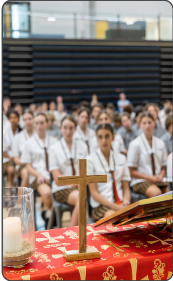
Excellence in Catholic Character