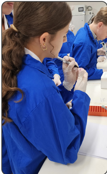
Excellence in STEM