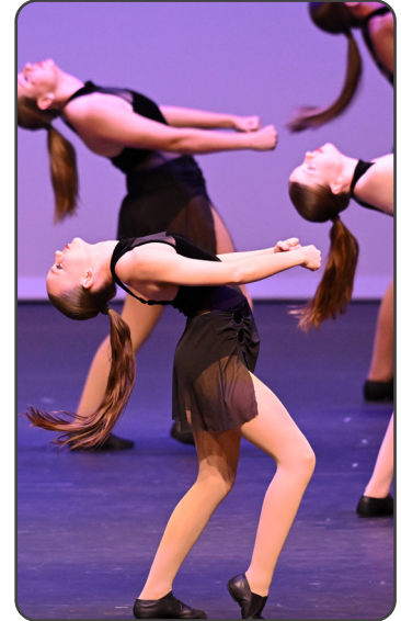
Excellence in The Arts