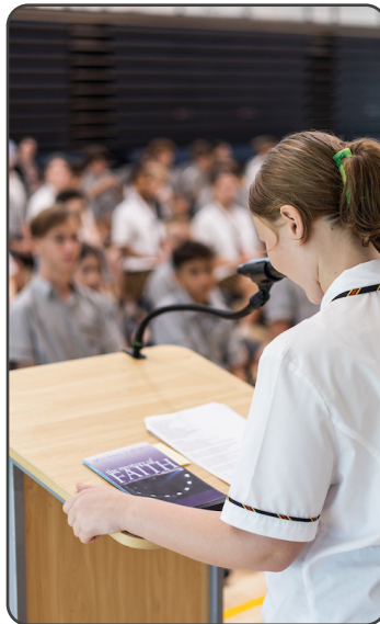
Excellence in Community Leadership