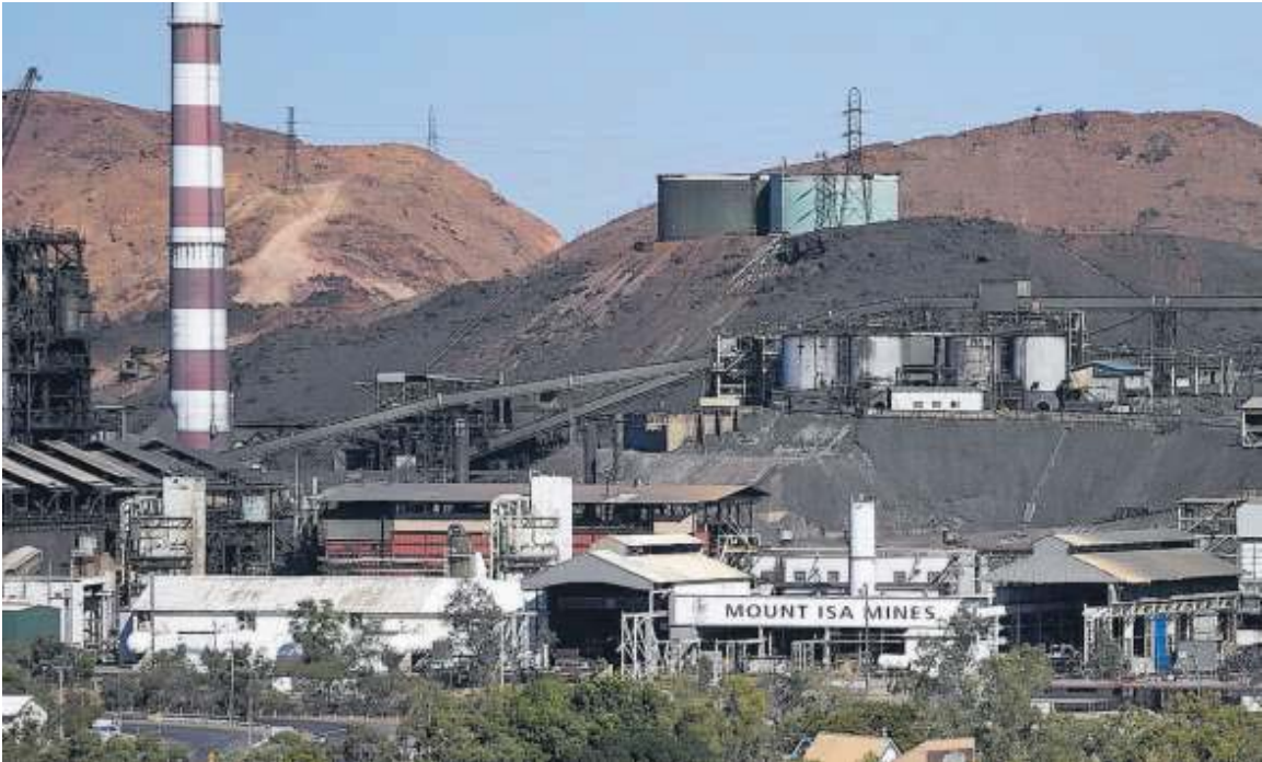
A major miner is seeking urgent government help to keep two of its operations going.