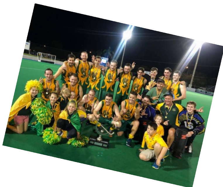
Division 1 Men's Winners Wests