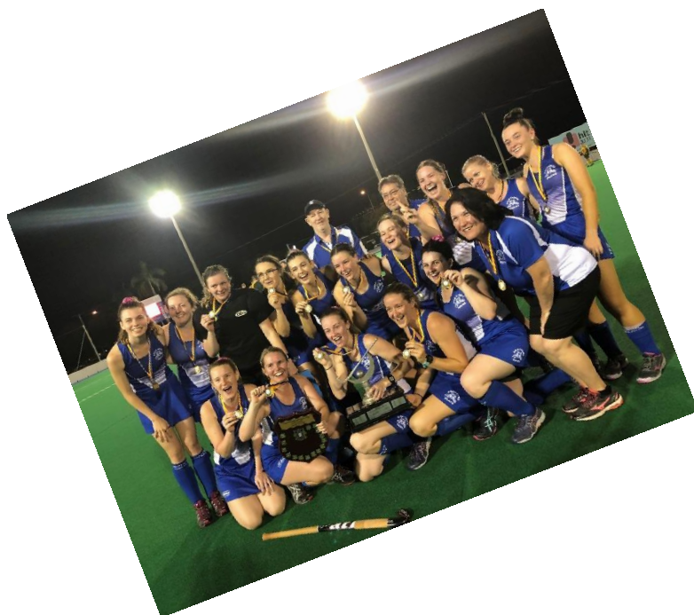
Division 1 Ladies Winners Brothers