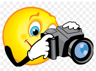
PHOTO CATCH UP DAY

Due to the number of students who were absent on Photo day in Term 1, we have negotiated a catch up photo day.