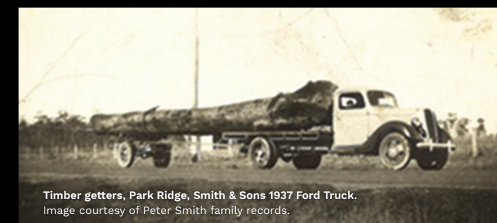
Timber getters, Park Ridge, Smith & Sons 1937 Ford Truck.