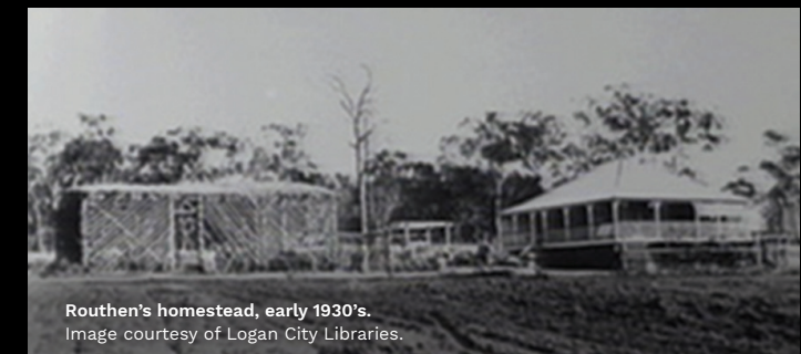
Routhen's homestead, early 1930's.