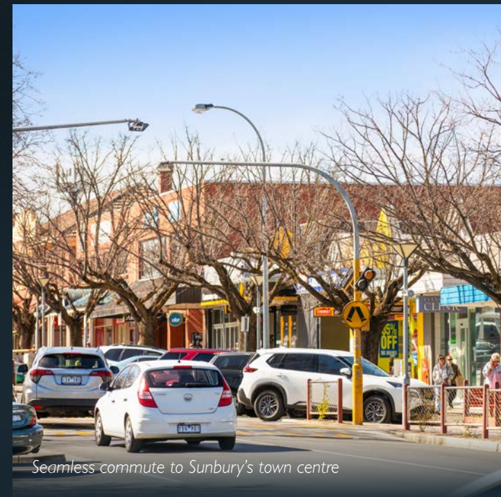
Seamless commute to Sunbury's town centre