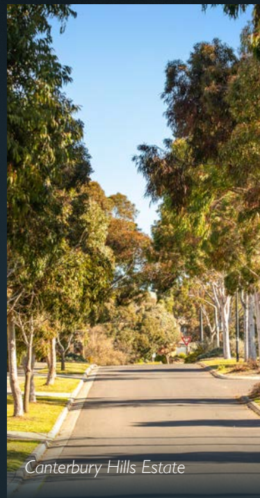
Canterbury Hills Estate