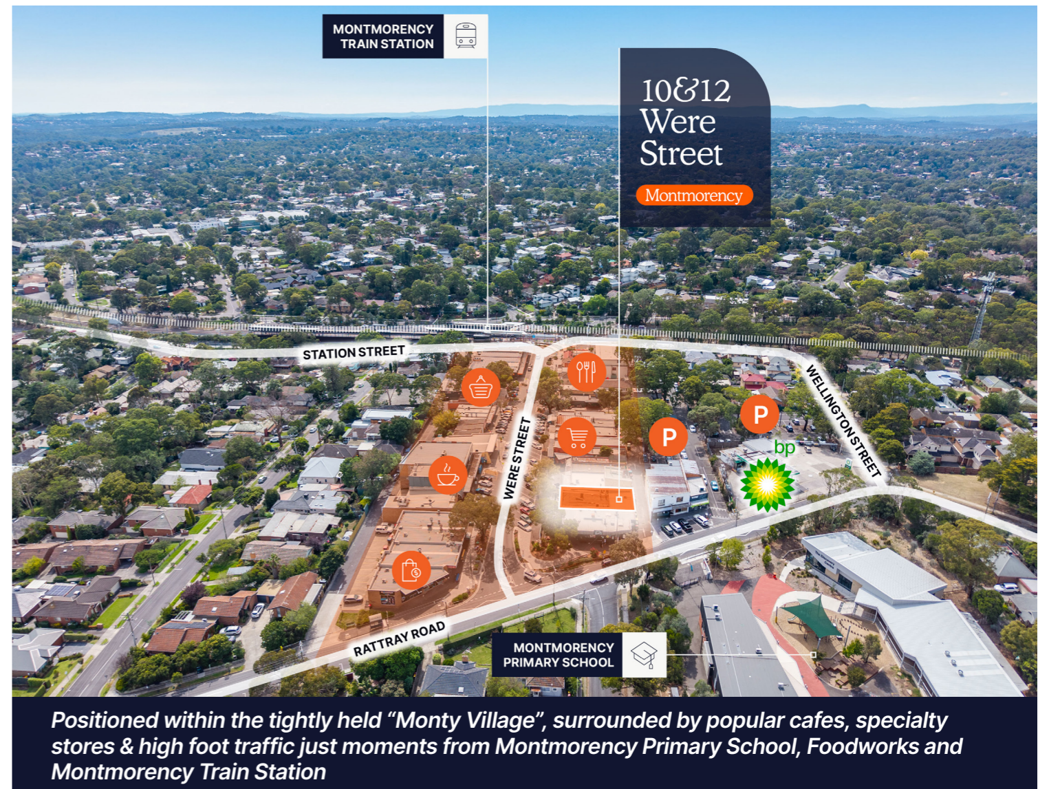
Positioned within the tightly held "Monty Village", surrounded by popular cafes, specialty stores & high foot traffic just moments from Montmorency Primary School, Foodworks and Montmorency Train Station