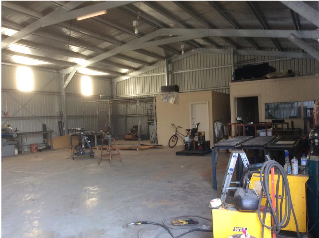
Interior showing office and amenities Unit 2