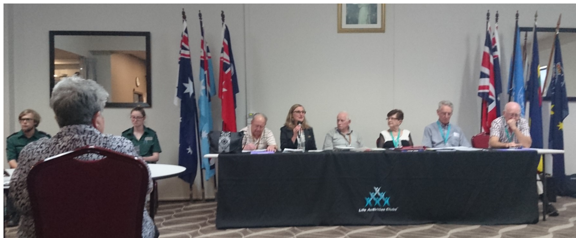
Taken at our Leader's meeting.