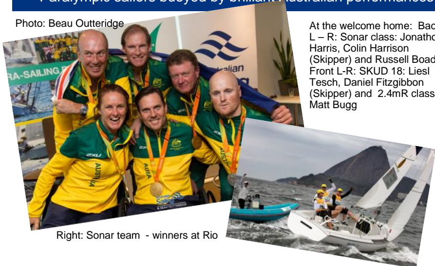
Right: Sonar team - winners at Rio