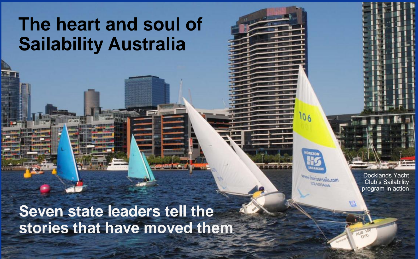
Docklands Yacht Club's Sailability program in action

Seven state leaders tell the stories that have moved them