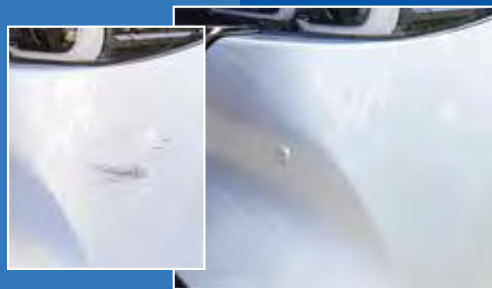
Bumper Bar Scrapes & Scratches