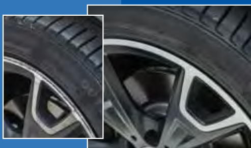
Alloy Wheel Scrapes