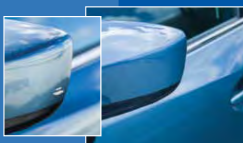
Side Mirror Scrapes & Scratches