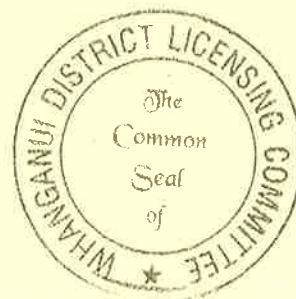
Secretary Whanganui District Licensing Committee

Dated at Whanganui on the 21 st day of August 2018.