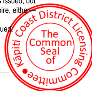
Secretary Kapiti Coast District Licensing Committee

Subject to the requirements of the Act relating to the payment of fees, and to the provisions of the Act relating to the suspension and cancellation of licences, the licence expires on: