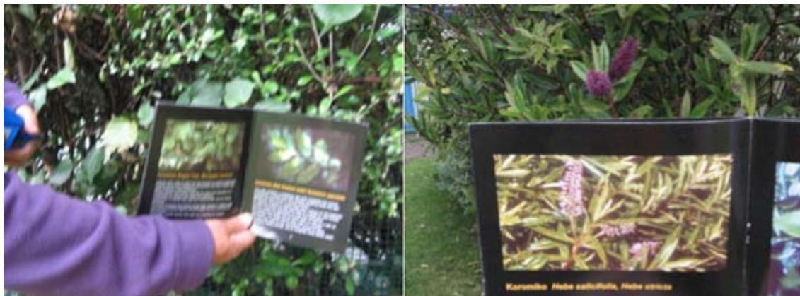
Figure 3. Identifying indigenous plants and their healing properties, Hawera Kindergarten.

renarrativisation addresses the ‘matter of concern’ of the suppression of indigenous ways of knowing, being and doing.