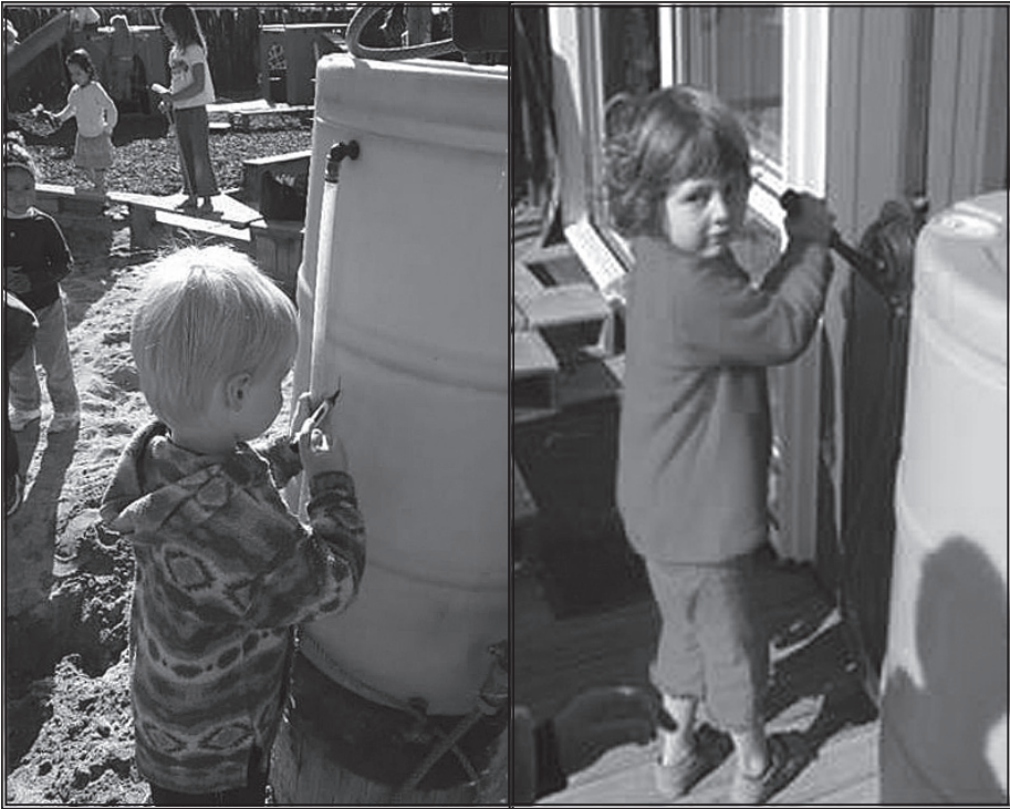
Water conservation at Papamoa Kindergarten

The teachers of the Raglan Childcare and Education Centre provided a narrative that expressed the notions of kaitiakitanga and manaakitanga in relation to a visiting monarch butterfly: