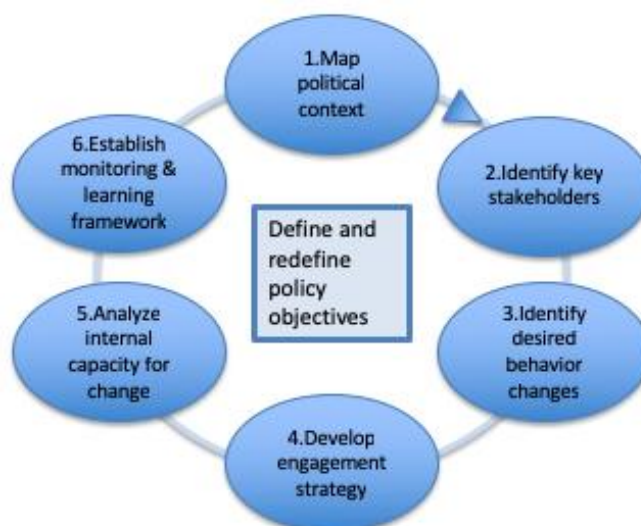
Figure 1. Adapted version of the ROMA model used by the SHIELA project (Tsai et al. , 2018) and by Hainey et al. (2018).

This was conducted through a series of semi-structured interviews, focus groups and workshops with members of the University Senior Leadership Team (n=12), Faculty Deans and Associate Deans, academic and professional staff of the University Faculties and Central Service Units (n=39), and students (n=6). The data collected was analysed along the six dimensions, of: (1) mapping of (political) context; (2) identifying key stakeholders; (3) identifying desired behaviour changes; (4) developing an engagement strategy; (5) analysing internal capacity to effect change; and (6) establishing monitoring and learning frame-works (as demonstrated in Figure 1). All data was validated by the LA roundtable group (see details below).