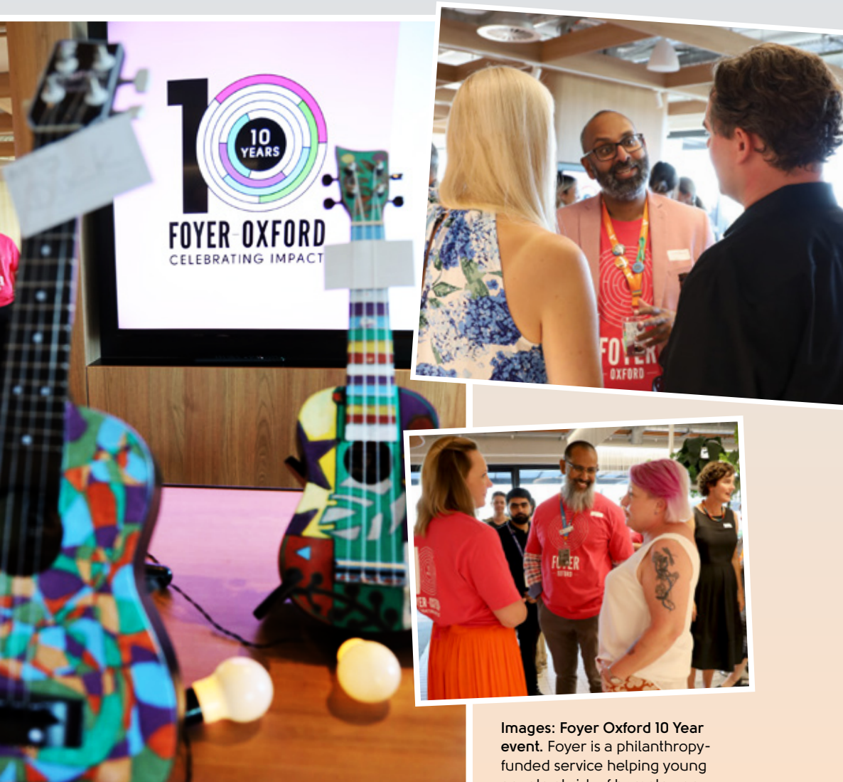
Images: Foyer Oxford 10 Year event. Foyer is a philanthropy-funded service helping young people at risk of homelessness.

Shared values and vision for a just and fair Western Australia where everyone can thrive.