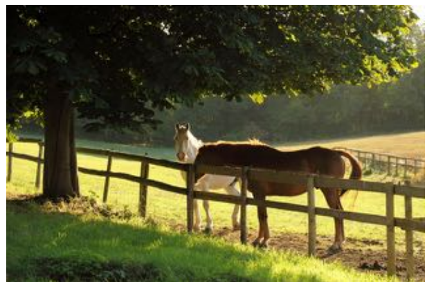
Toshi doesn't like having his photo shown, but he loves horses, so ...

During our ministry we learn a great deal about the life of a seafarer. They endure great sacrifices in order for the world to operate normally. A primary example is the pressure it places on family relationships. A life spent mainly out at sea presents a huge difficulty for contact with loved ones. Twenty years ago, it was common practice for seafarers to be locked into contracts with shipping companies for periods of 15 months at a time. Recently these practices have been relaxed to a 9 - 10 month period with a break of 2 - 3 months between contracts. Unfortunately, there is no source of income during these breaks. Therefore, it is not unusual for seafarers to extend their respective contracts to periods of two years. This is obviously a very long time to be away from home and a tremendous burden for the seafarer and his family to endure.