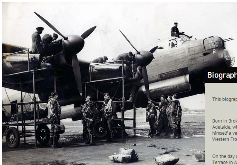
4 153 Squadron aircrew chatting with their ground crew while the aircraft undergoes maintenance.