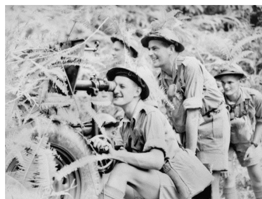
5 Malaya, an A.I.F. anti-tank gun crew, 03/1941, AWM 006372