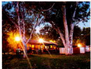
Grab a drink at the Swinging Arm Bar