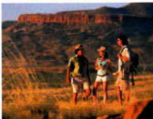
Bushwalking on El Questro Station

Whichever way you look at it, El Questro is a holiday experience you will never forget.