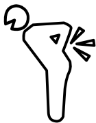
Aches and pains