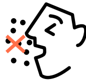
Loss of taste or smell