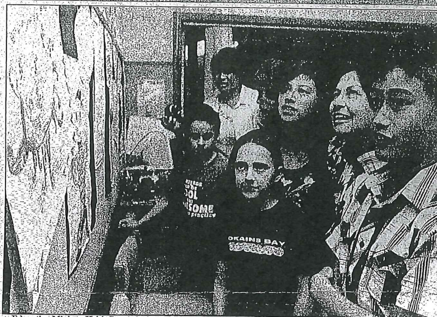
Education Minister Hekia Parata looks at children's posters about what is special about their school in Okains Bay after she had discussed possible changes in education delivery in the Bay last Friday evening.

She assured her audience, which was mostly school