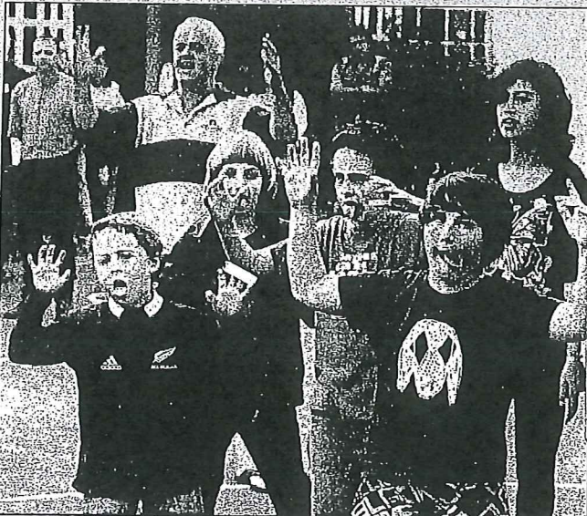
Ms Parata was greeted by a rousing haka when she arrived at Okains Bay.

She said that with a Peninsula background herself, she had really gone through the community pain when her Department went through the decision to close Pigeon Bay School.