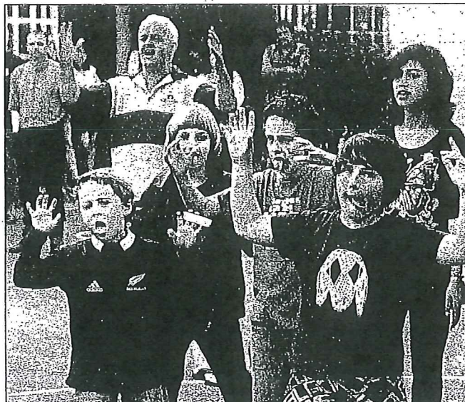
Ms Parata was greeted by a rousing haka when she arrived at Okains Bay.

She said that with a Peninsula background herself, she had really gone through the community pain when her Department went through the decision to close Pigeon Bay School.