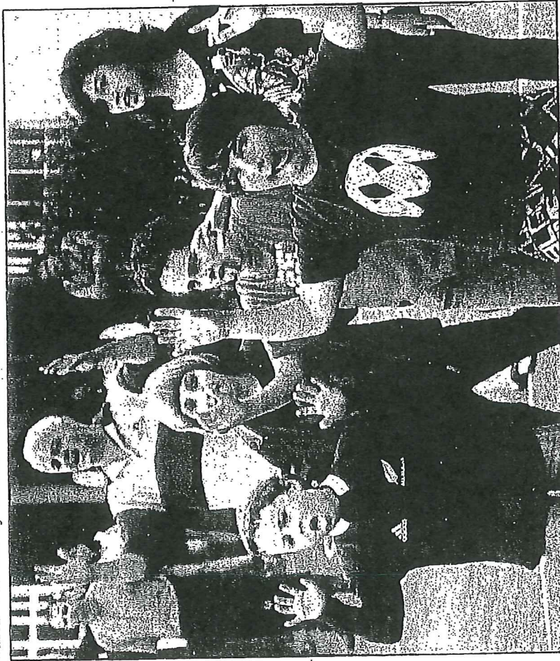
Ms Parata was greeted by a rousing haka when she arrived at Okains Bay.