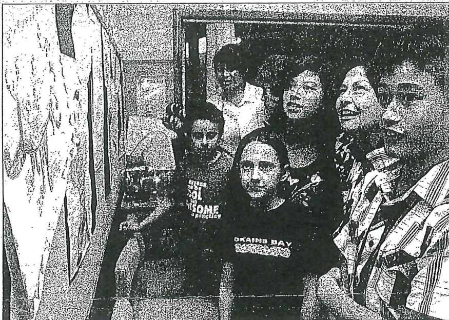
Education Minister Hekia Parata looks at children's posters about what is special about their school in Okains Bay last Friday evening.

She assured her audience, which was mostly school