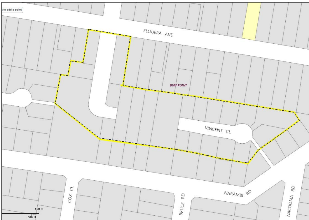
Figure 2 Roads and Traffic Management – Vincent Close, Buff Point