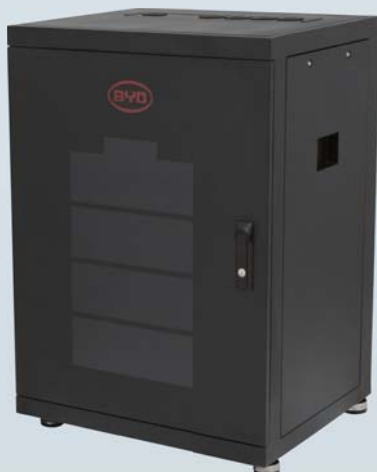
B-Box Pro 2.5~10.0