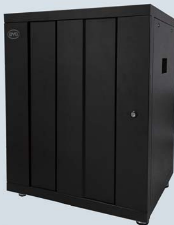
B-Box Pro 13.8