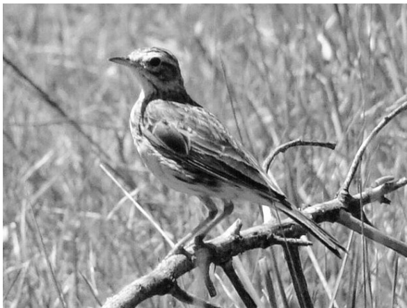
Left - Richards Pipit

Breamlea Flora and Fauna reserve, November 6