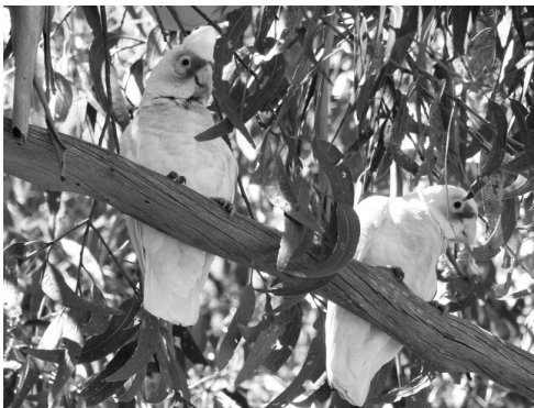
Long billed Corella - Chewton

Monthly newsletter of the Castlemaine Field Naturalists Club Inc.