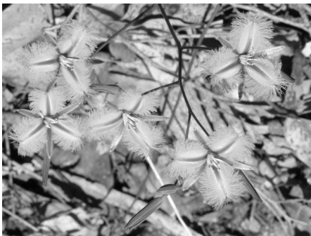
Fringe-lilies Thysanotus tuberosus - Noel Young

Next stop Fryerstown Cemetery, and at least two pairs of White-winged Trillers, one of which was nest building, too, as was a pair of Jacky Winters, and for botanical interest, a lovely patch of Magenta Storks-bills Pelargonium rodneyanum . From there to Glenluce Springs for lunch, and more Rufous Whistlers, some Prickley Starwort and Kangaroo Apple Solanum lacinatum , then to Warburtons Bridge, where we found a number of camps, including two complete with horses, but the birds didn't seem to mind much, and there were lots of Brown Treecreepers and a few White throated, too. While George and Noel wandered off to see what they could find further along the creek Kit and I sat at the picnic table and watched three or four little bobbing forms among the grass, which we had realised were Brown Treecreepers, and as we watched, the numbers grew, there were 9 or 10, possibly more, but they had been hidden in the short grass. Three worked their way towards us as we sat there, and one found something very tasty, which attracted the one behind, which went to investigate, and both settled down to a great feed while the third one continued towards us. What a delightful way to spend an after-lunch rest time!