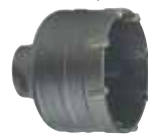
Masonry Hammer Carbide Core Bits (Light Duty)