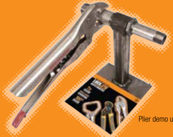
Plier demo unit