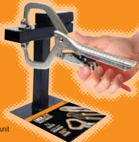
Clamp demo unit