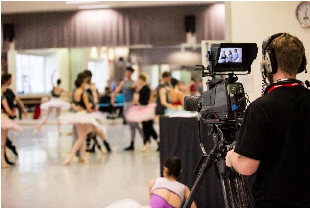
Artists of The Australian Ballet.

20 hours non-stop exclusive backstage footage From five of the world's leading ballet companies To be streamed on Facebook Live for the first time. The Australian Ballet, Bolshoi Ballet, The Royal Ballet, The National Ballet of Canada and San Francisco Ballet will collaborate for the third year in a row to broadcast 20 hours of behind-the-scenes footage on Tuesday 4 October. For the first time the stream of World Ballet Day LIVE will be shown via Facebook LIVE – the longest broadcast ever to be shown on the platform.