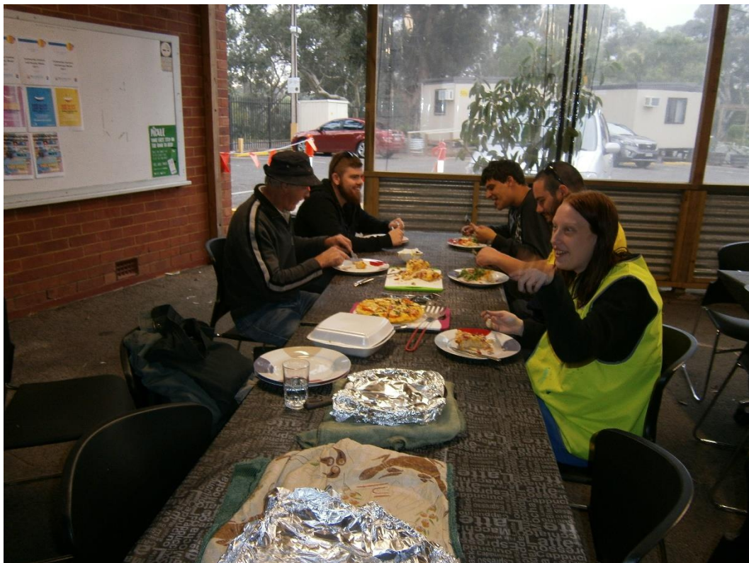
The team enjoying a well-deserved lunch.