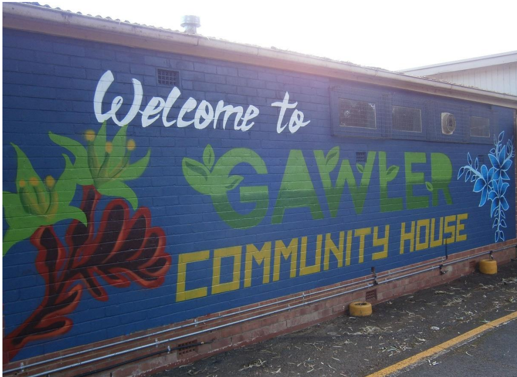
The finished product.