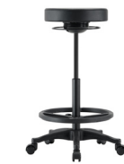
DRAFTING GAS LIFT Extended height

360° SEAT TILT Seat tilt to promote 'active sitting'.