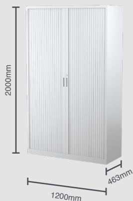
FIVE SHELF LEVELS