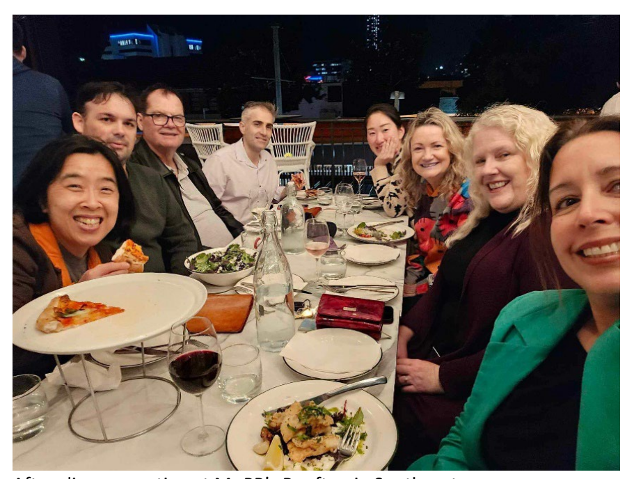
After-dinner meeting at Mr PP's Rooftop in Southport

Dinner this month: Mr PP's Rooftop, 43 Nerang Street, Southport