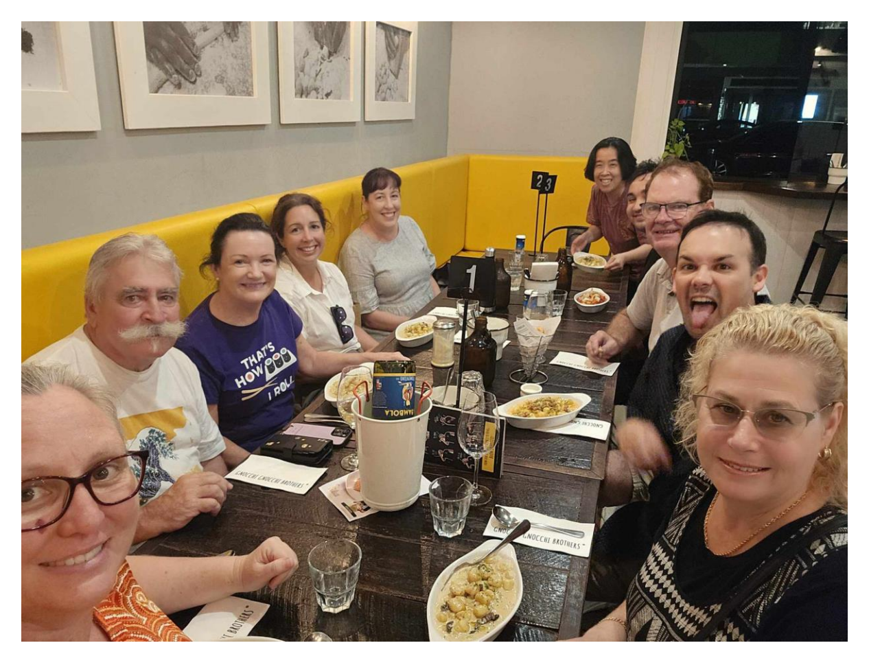
Dinner this month was at Gnocchi brothers, Southport.