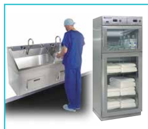
Stainless Steel Warming Cabinets, Scrub Sinks and Storage Solutions