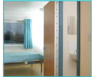
Full Length Single Swinging Anti-Ligature Geared Privacy Hinge