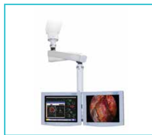
High Definition Surgical Monitors