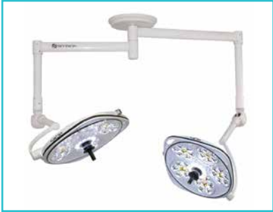
LED Operating Theatre, Examination and Procedure Lighting Systems