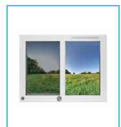
Safevent® Window System