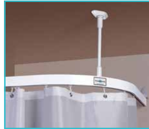
Anti-Ligature Magnetic Shower Track and Screen Suspension System