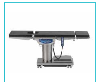
Competitive range of Electro Hydraulic Operating Tables