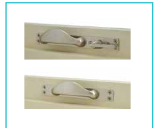
Anti-Ligature Window Handles, Restrictors and Related Hardware