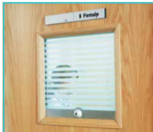
Range of Anti-Ligature Privacy Vision Panels