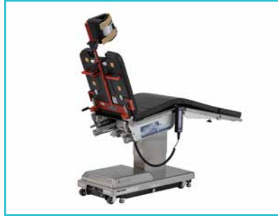
Bariatric, Orthopaedic, Urological, Gynaecological and Ophthalmic Patient Positioning Devices