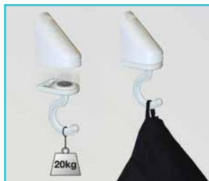
Anti-Ligature Load Release Pliable and Rigid Coat Hooks