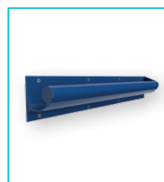
Contour Anti-Ligature Handrail