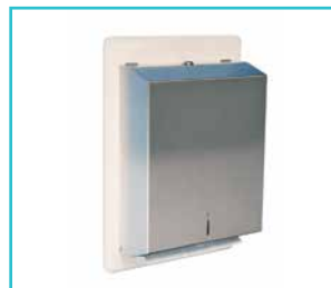
Anti-Ligature Mounting Plates for Soap, Paper Towel and other Sanitary Dispensers