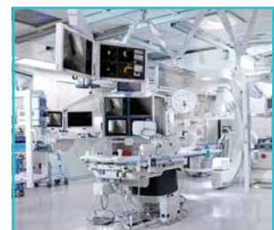
Cath Lab Lighting, Services Pendants, Monitors and Furniture