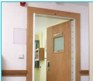
Anti-Ligature Removable Door Stop and Full Length Double Swinging Privacy Hinge Package