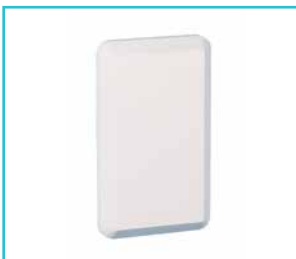
Load Release Anti-Ligature Mounting Plates