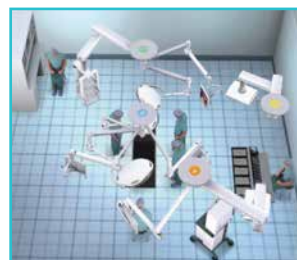
3D CAD Modelling and Equipment Planning Capabilities