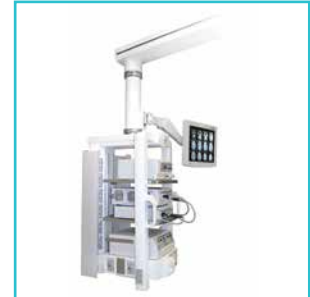
Equipment Carrier Solutions