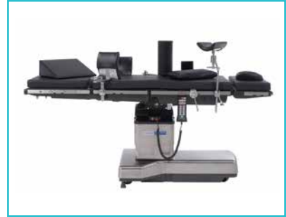
Operating Table Accessories, Consumables and Gel Pressure Care Products