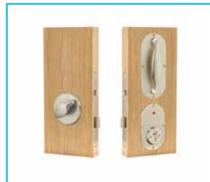
Anti-Ligature Primary and Secondary Anti-Barricade Lockset Solutions