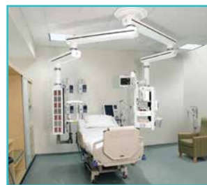
Intensive Care Unit Services Pendants, Monitors, Beds and Clinical Furniture