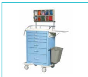
Storage and Workstation Solutions