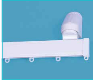
Flexible Anti-Ligature Magnetic Curtain Tracking