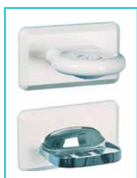
Anti-Ligature Load Release Soap Dishes