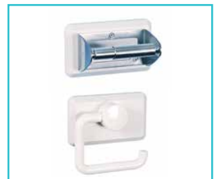
Anti-Ligature Magnetic Toilet Roll Holders