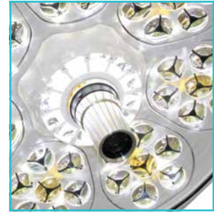
High Definition Room and Light Head Camera Systems