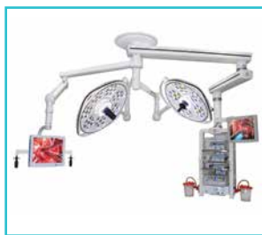
Single Central Mount Light, Monitor, Equipment & Services Pendants