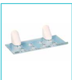
Anti-Ligature Load Release Polycarbonate Shelf Set