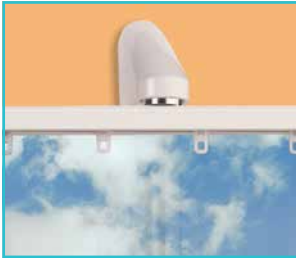
Anti-Ligature Magnetic Curtain Suspension System

General Manager – Private Mental Health Clinic